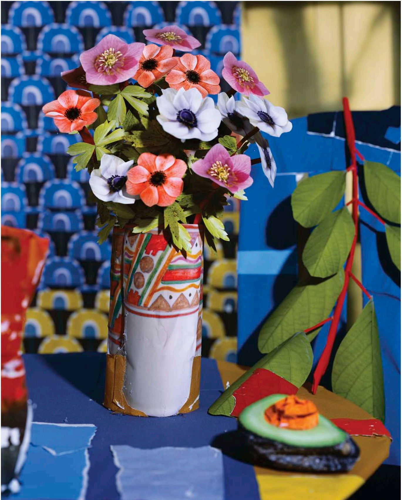
Anemone Flowers and Avocado, 2012