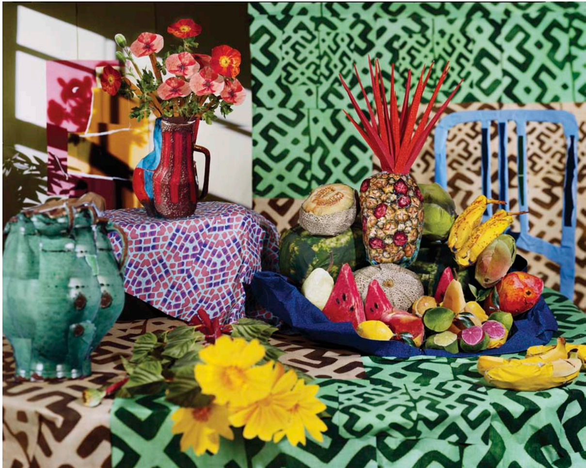
Tropical Still Life, 2012

Midnight Blue Bust is intended to form the left side of a diptych with Anemone Flowers and Avocado , suggesting “Joy and Sorrow” to Gordon, his work characterised by dualism – the play between the decorative and the disturbing, the grotesque and the beautiful. “The idea of transformation has always been important to me – the raw ugly bits are transformed through light (and shadow) into an idealised form”. Illumination allows the moment of perfection to be recorded in the photographic instant, whilst simultaneously capturing its imperfect antithesis.