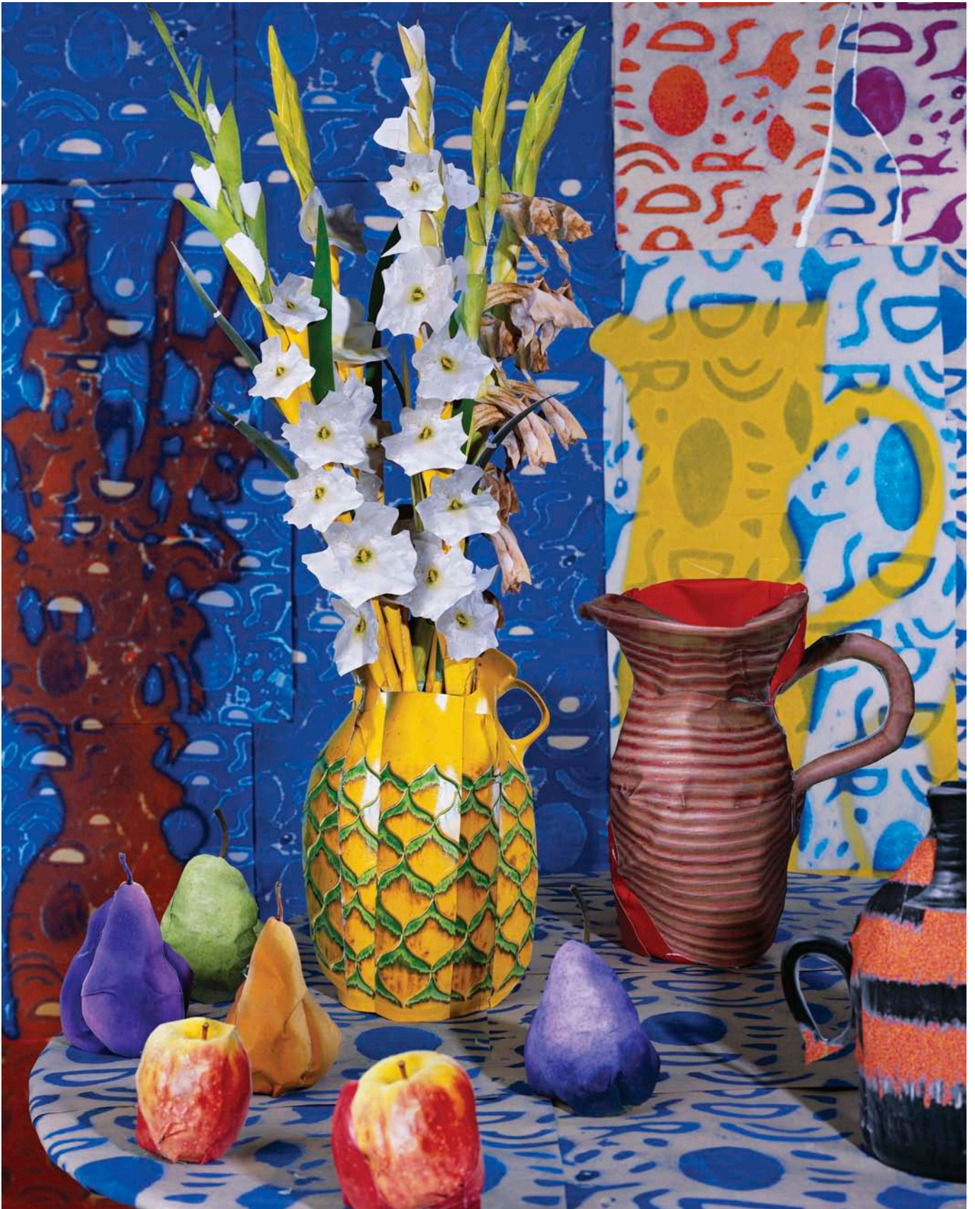
Shadows and Pears, 2012