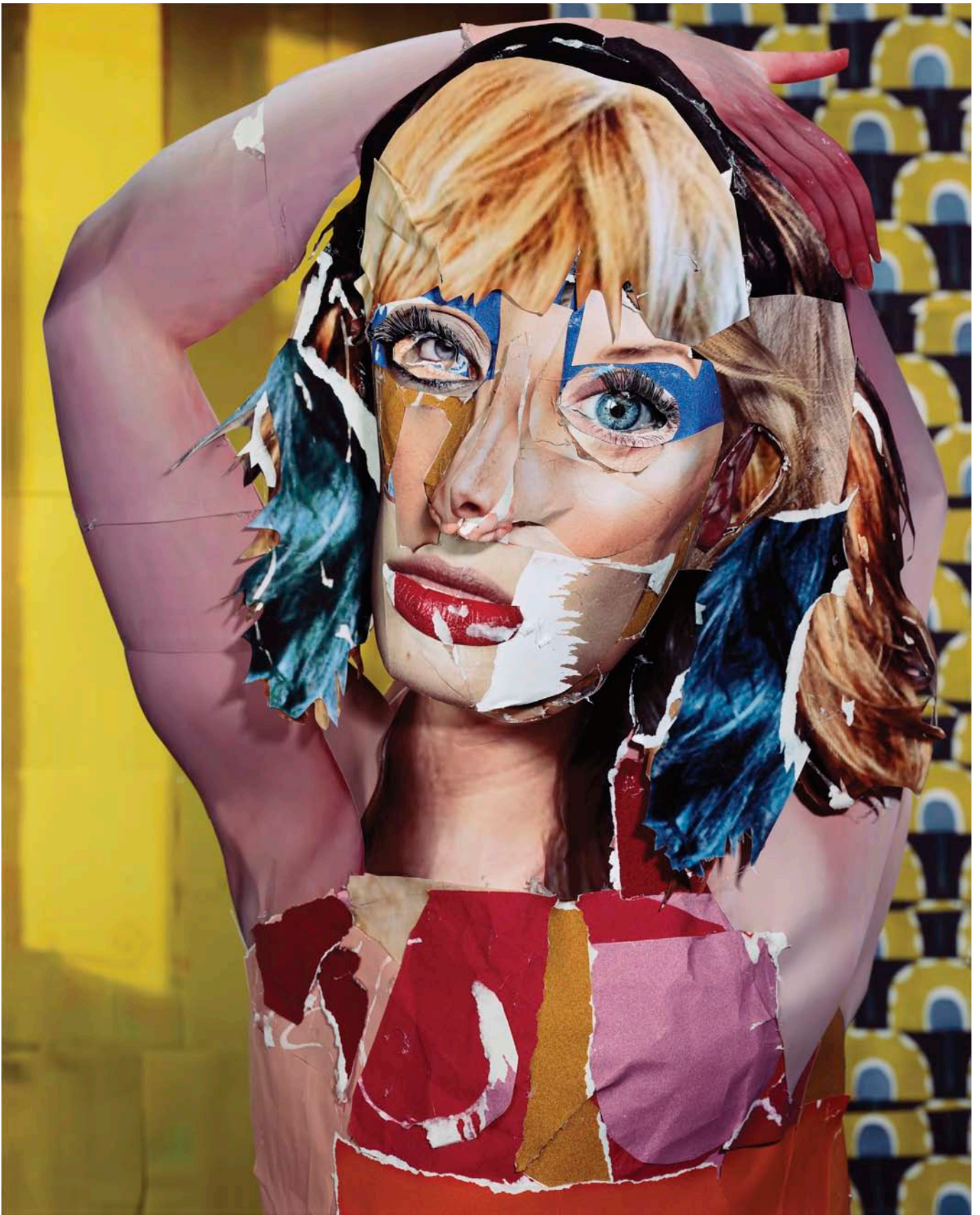
Portrait in Yellow and Blue, 2012