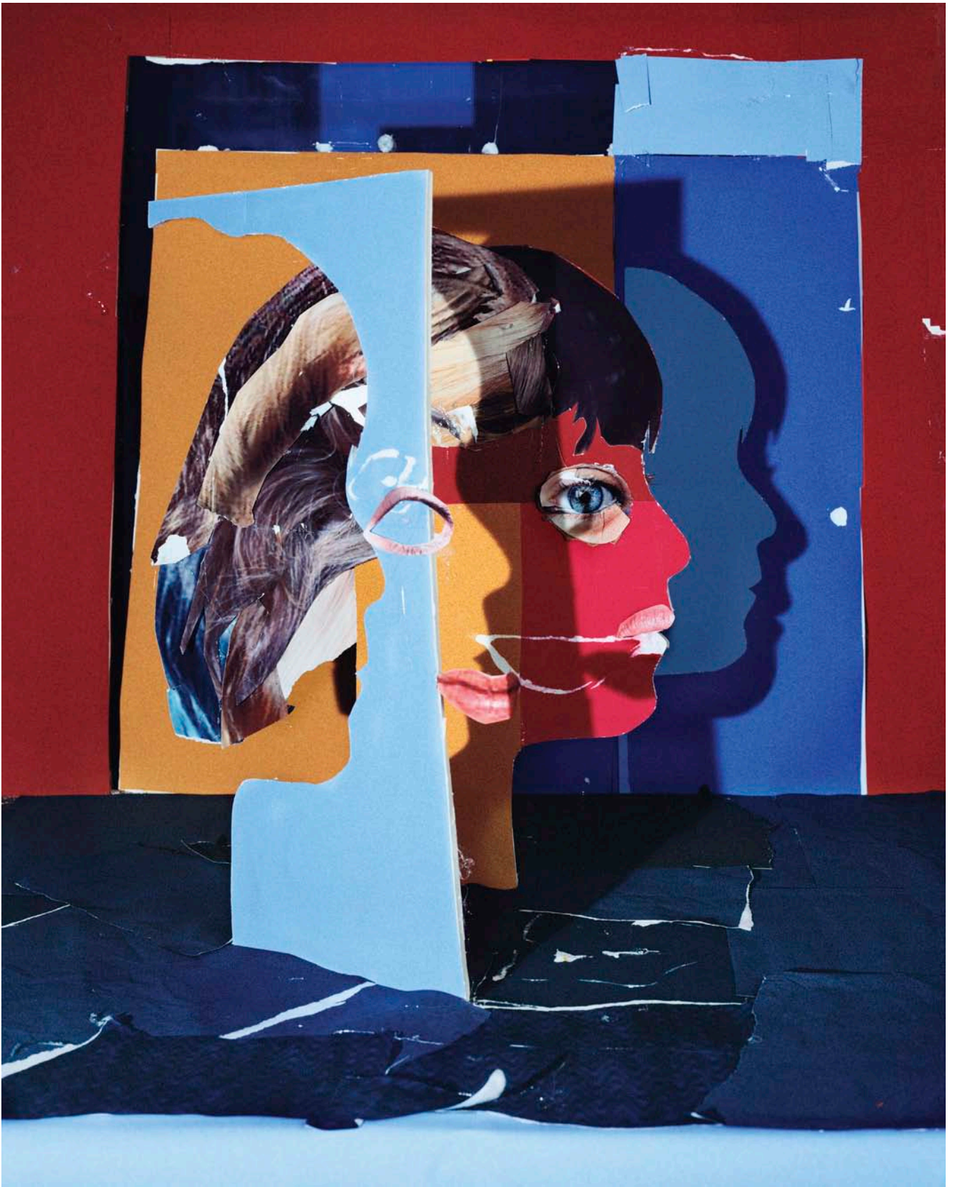
Portrait in Ruby and Blue, 2012