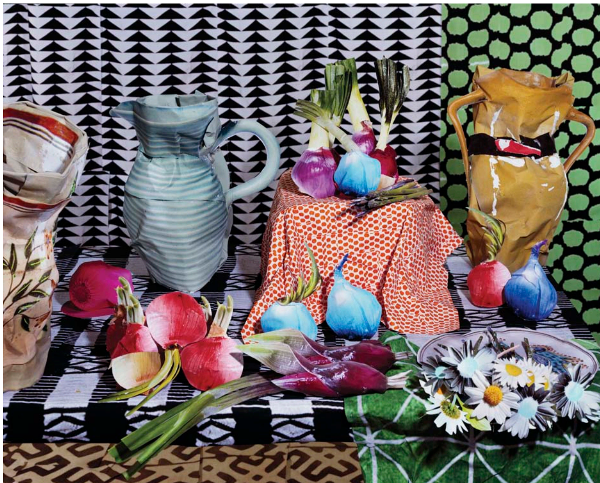
Pink Onions, 2012

Daniel Gordon's work has a gestural quality. It's not a Post-Modernist sensibility nor does it offer-up a deliberately impoverished reference to the original source inspiration. His is in many ways a painterly eye that finds photographic equivalences for the brush stroke, the density of paint, the inflection of light to depict the natural world and the human form.