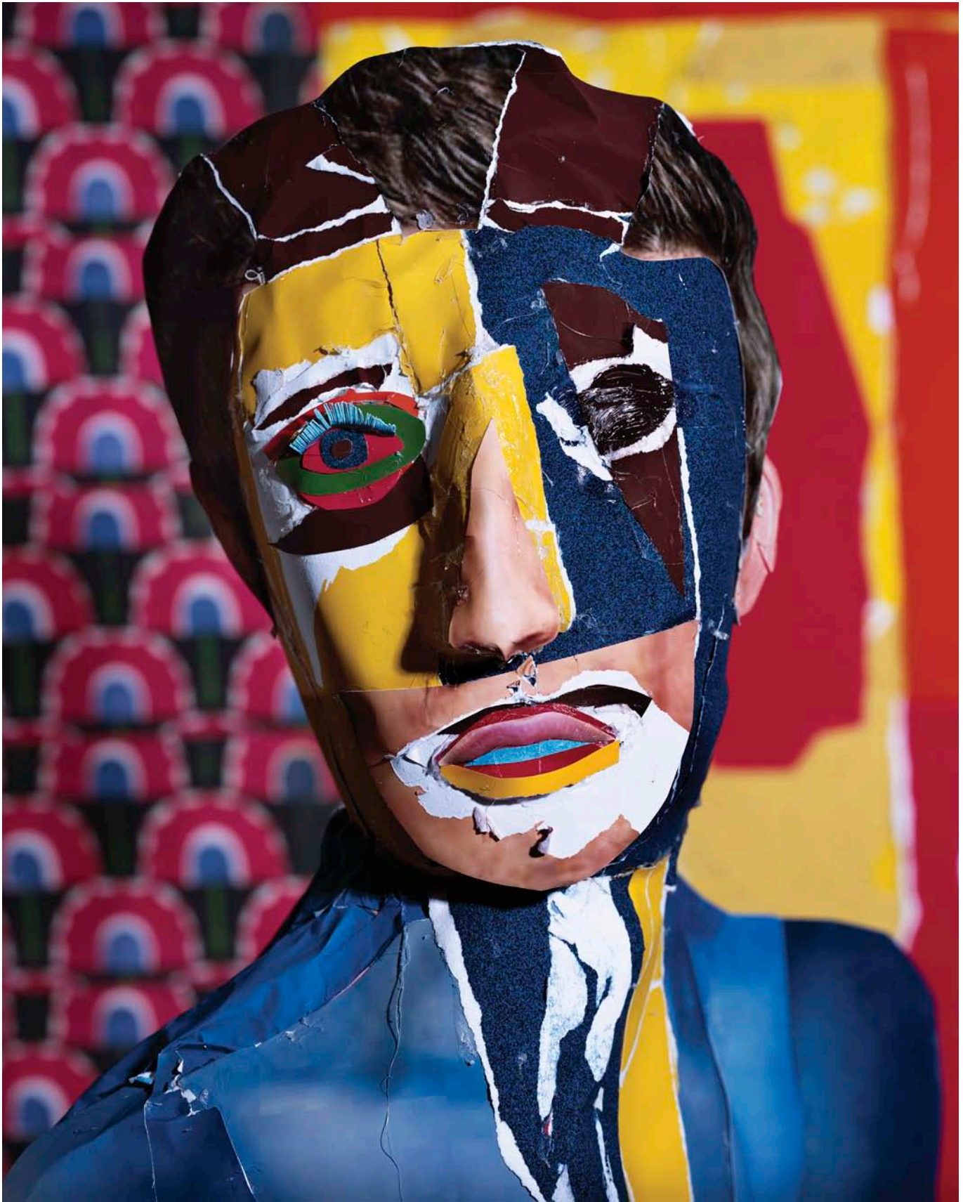
Pink Eyed Portrait, 2012