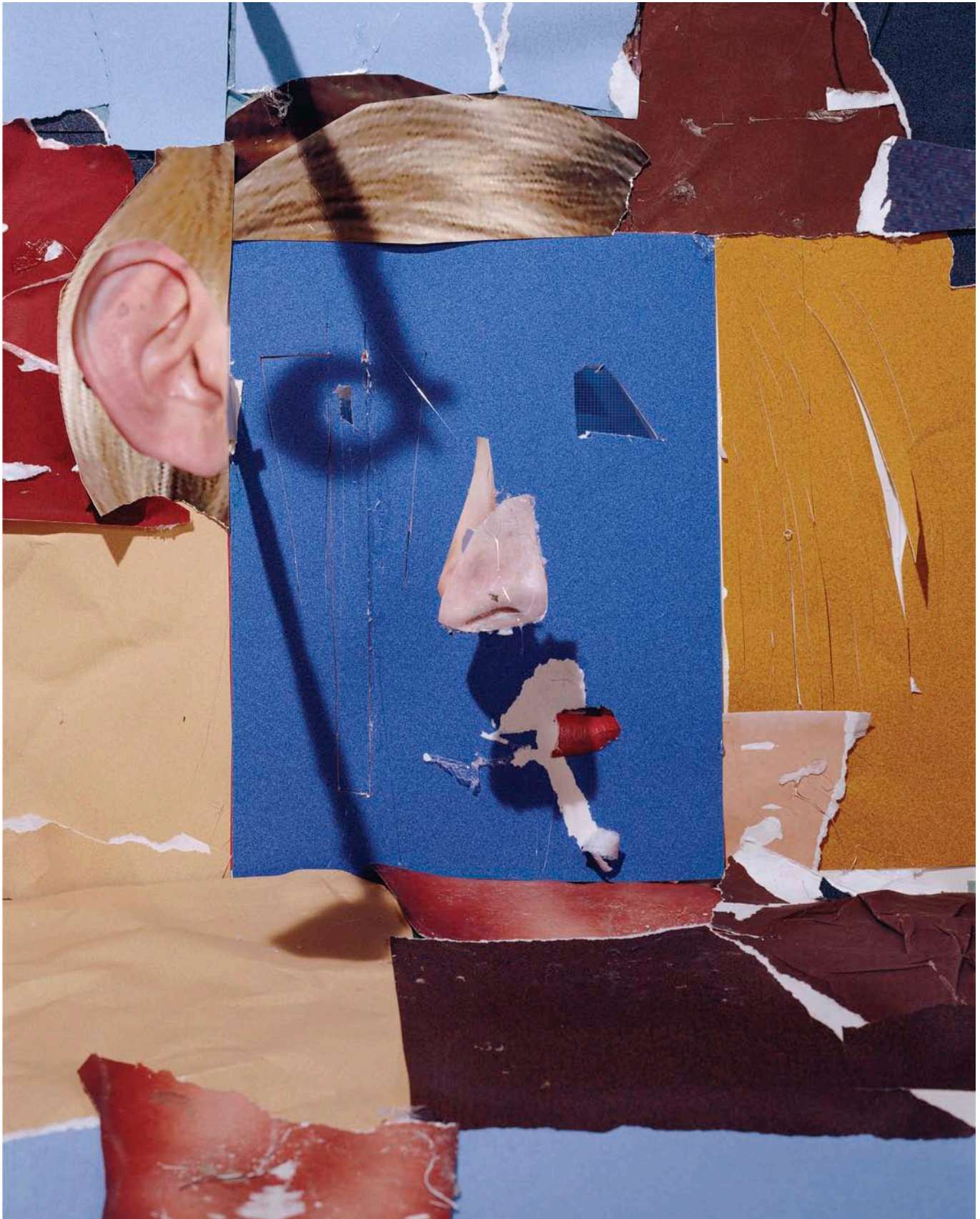
Blue Face II, 2012