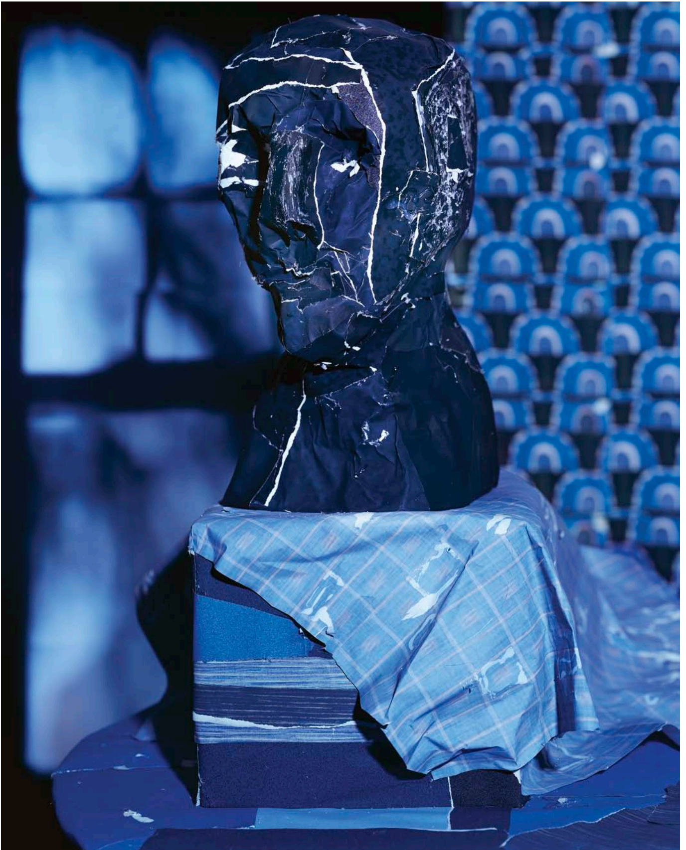
Midnight Blue Bust, 2012