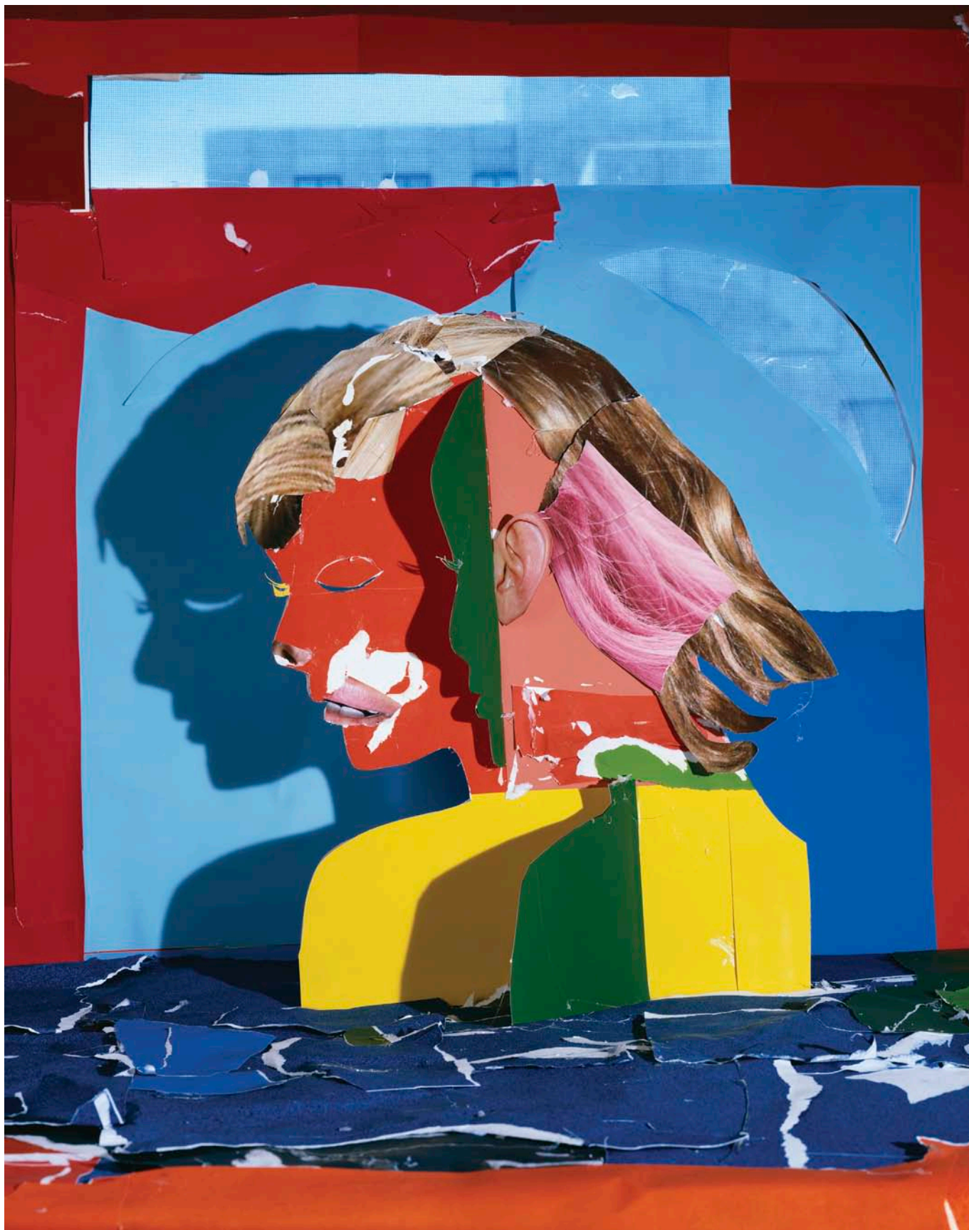
Crescent Eyed Portrait, 2012