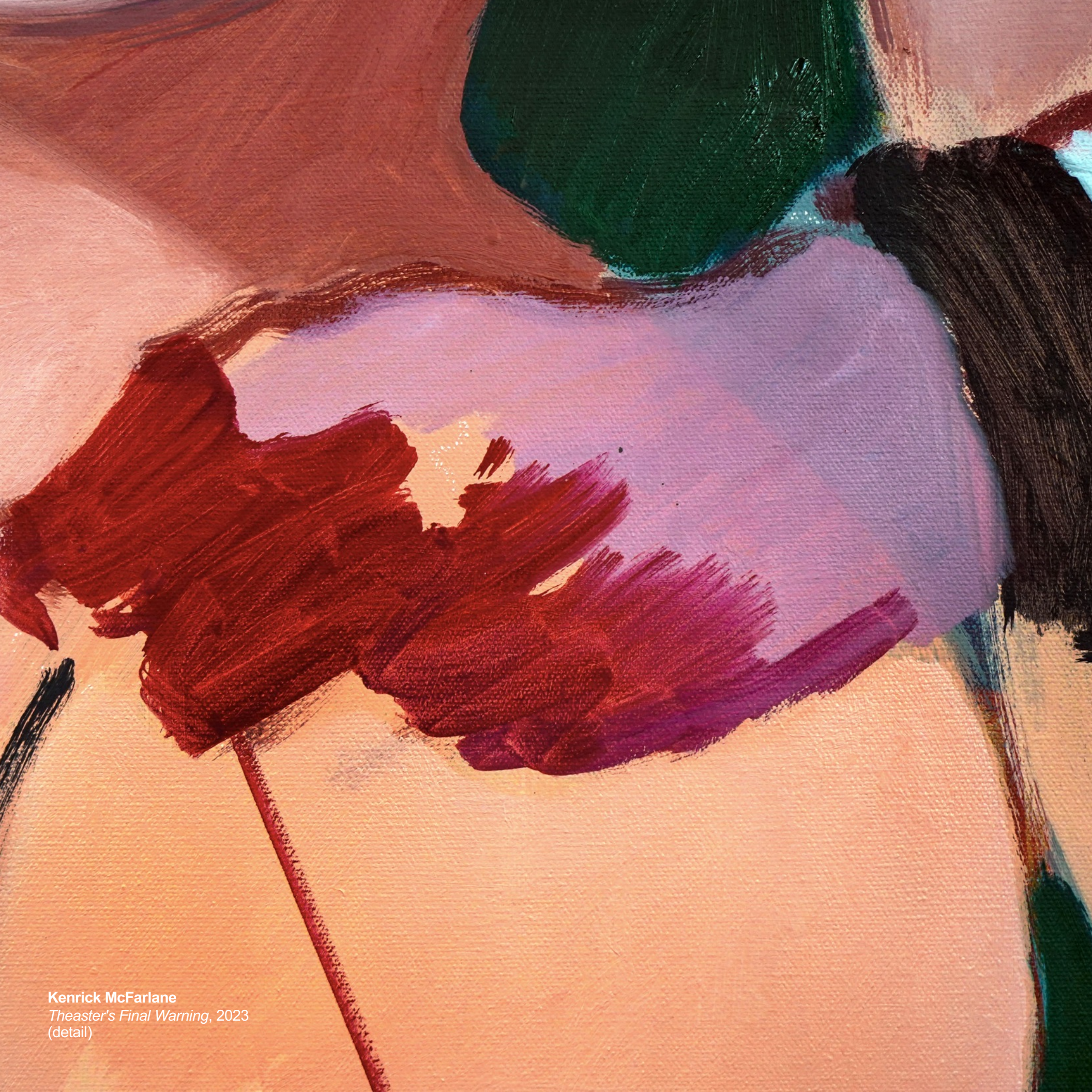
Kenrick McFarlane Theaster's Final Warning , 2023 (detail)