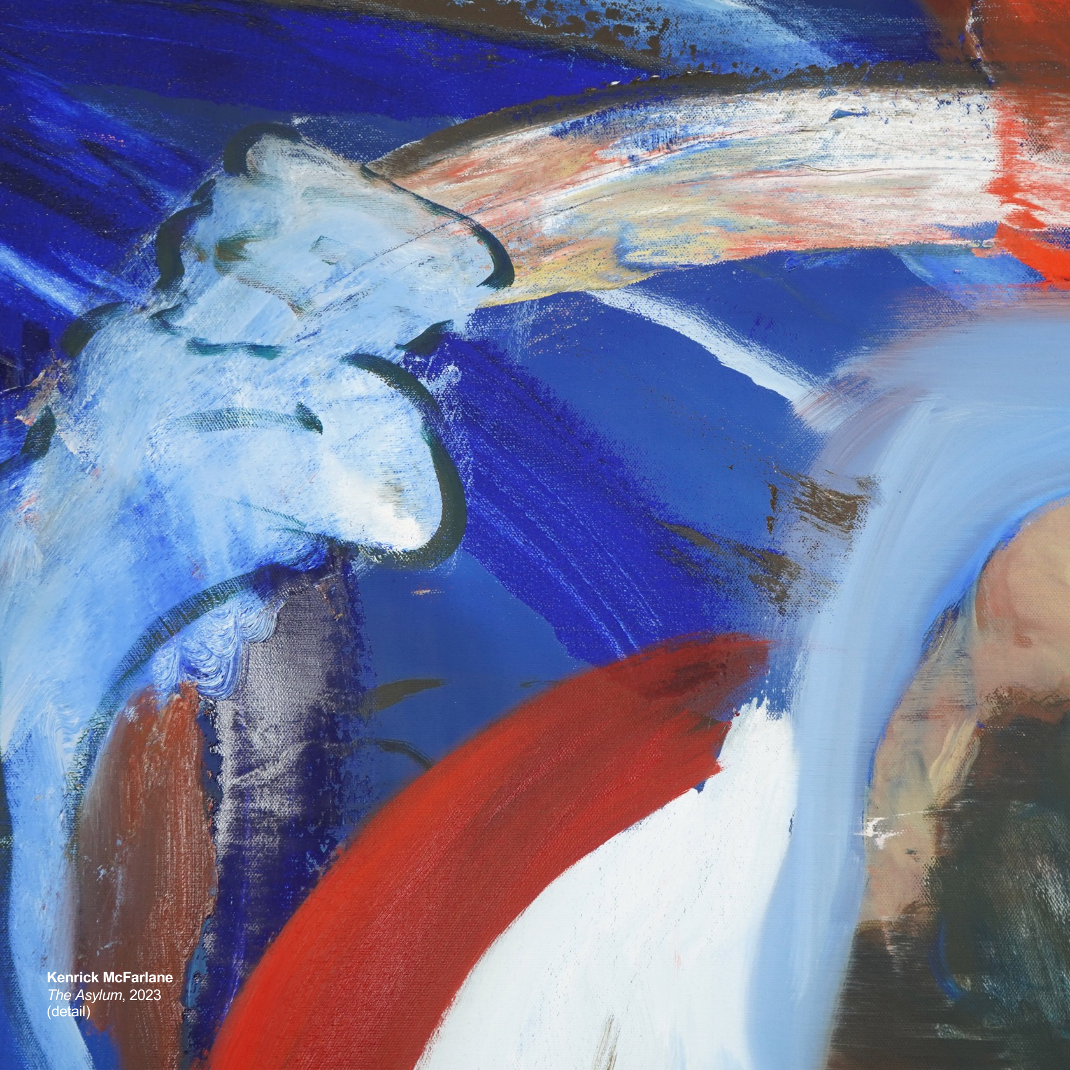
Kenrick McFarlane The Asylum , 2023 (detail)