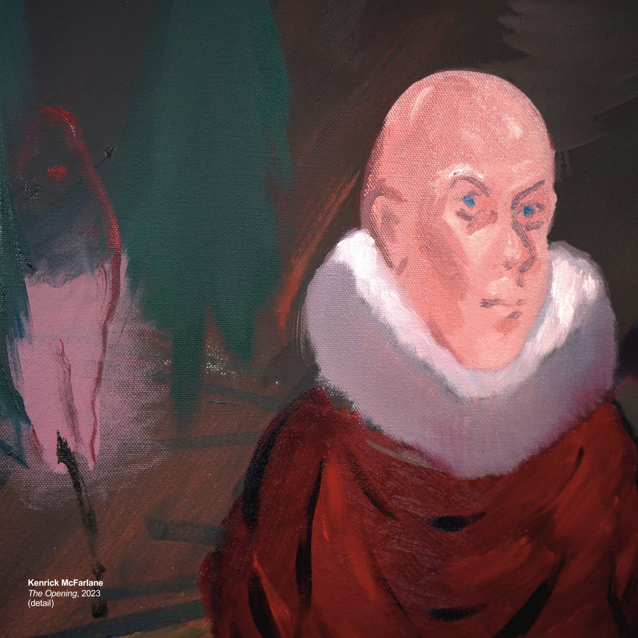
Kenrick McFarlane The Opening , 2023 (detail)