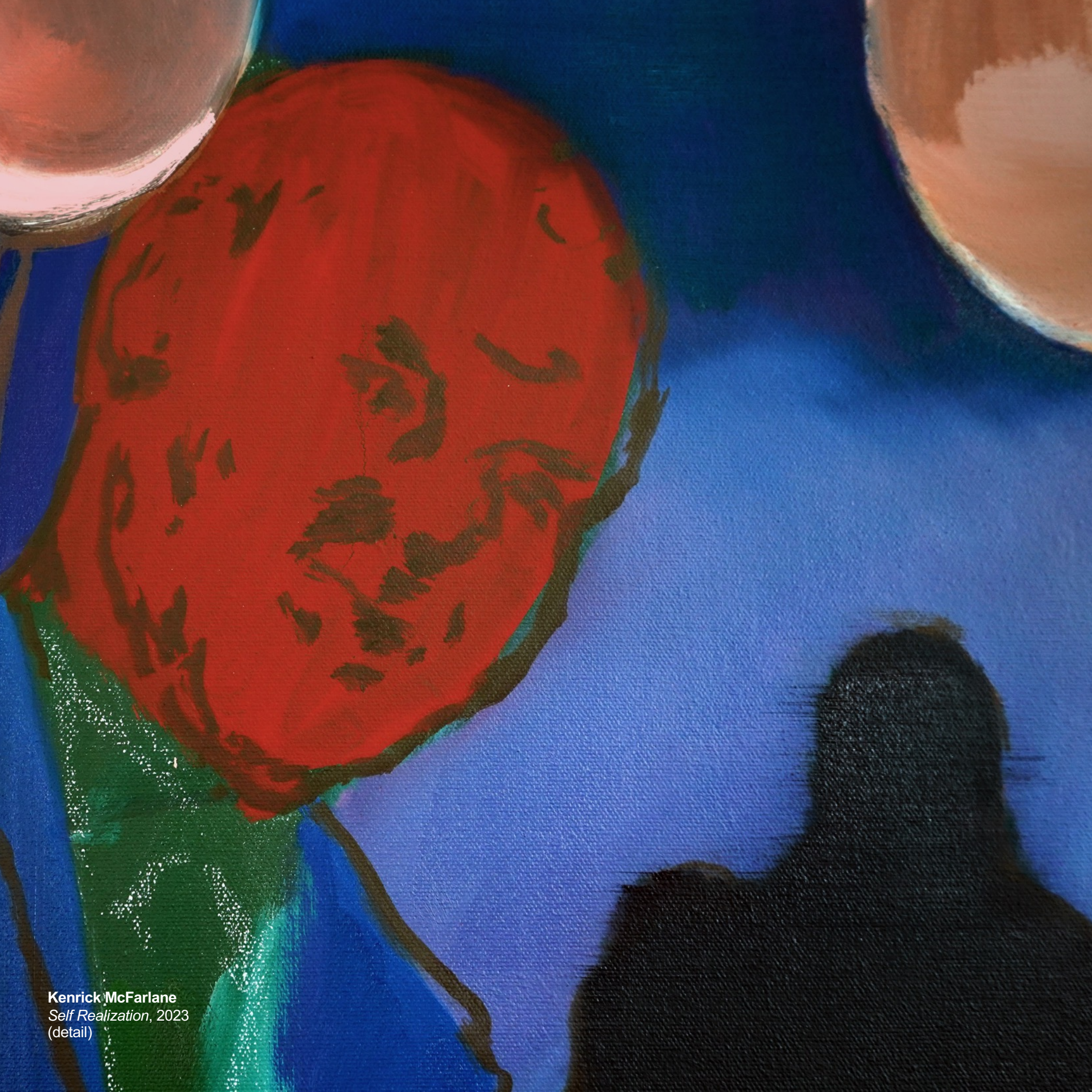
Kenrick McFarlane Self Realization , 2023 (detail)