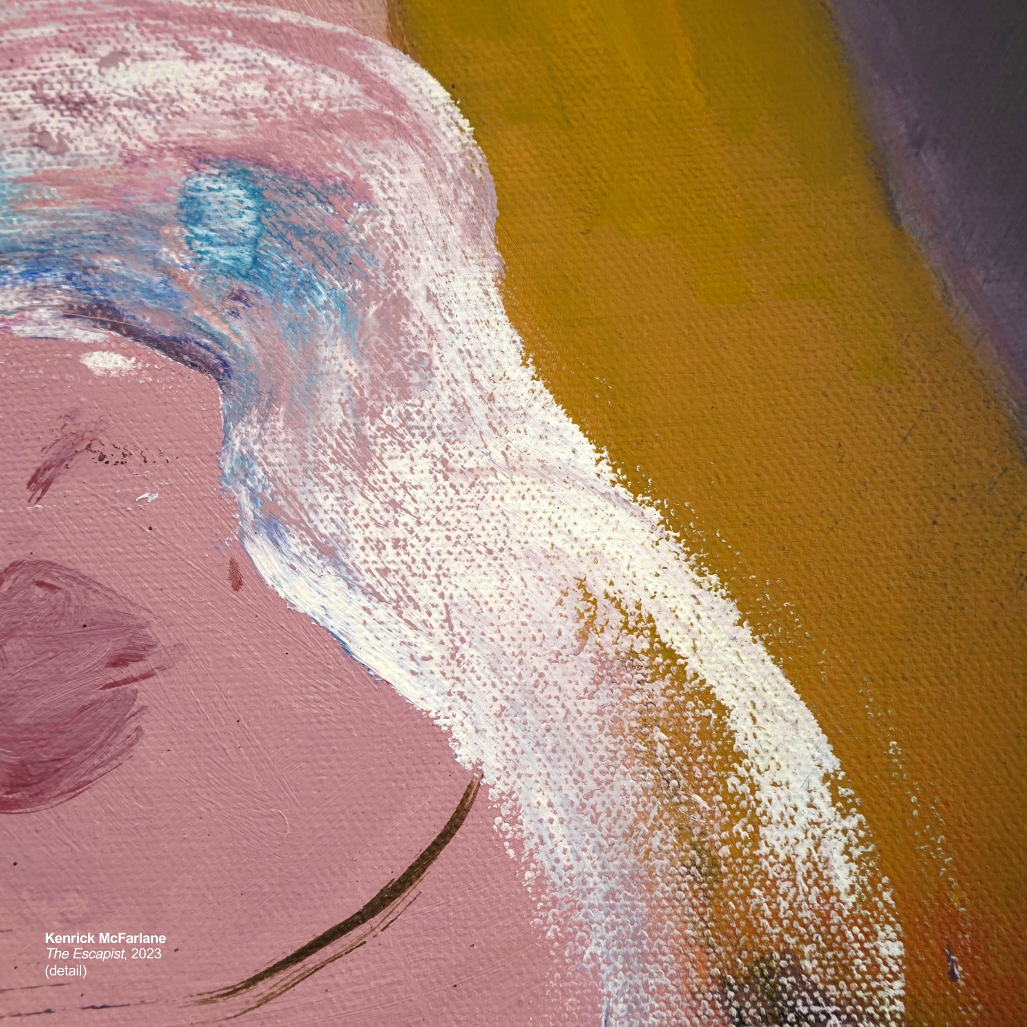
Kenrick McFarlane The Escapist , 2023 (detail)