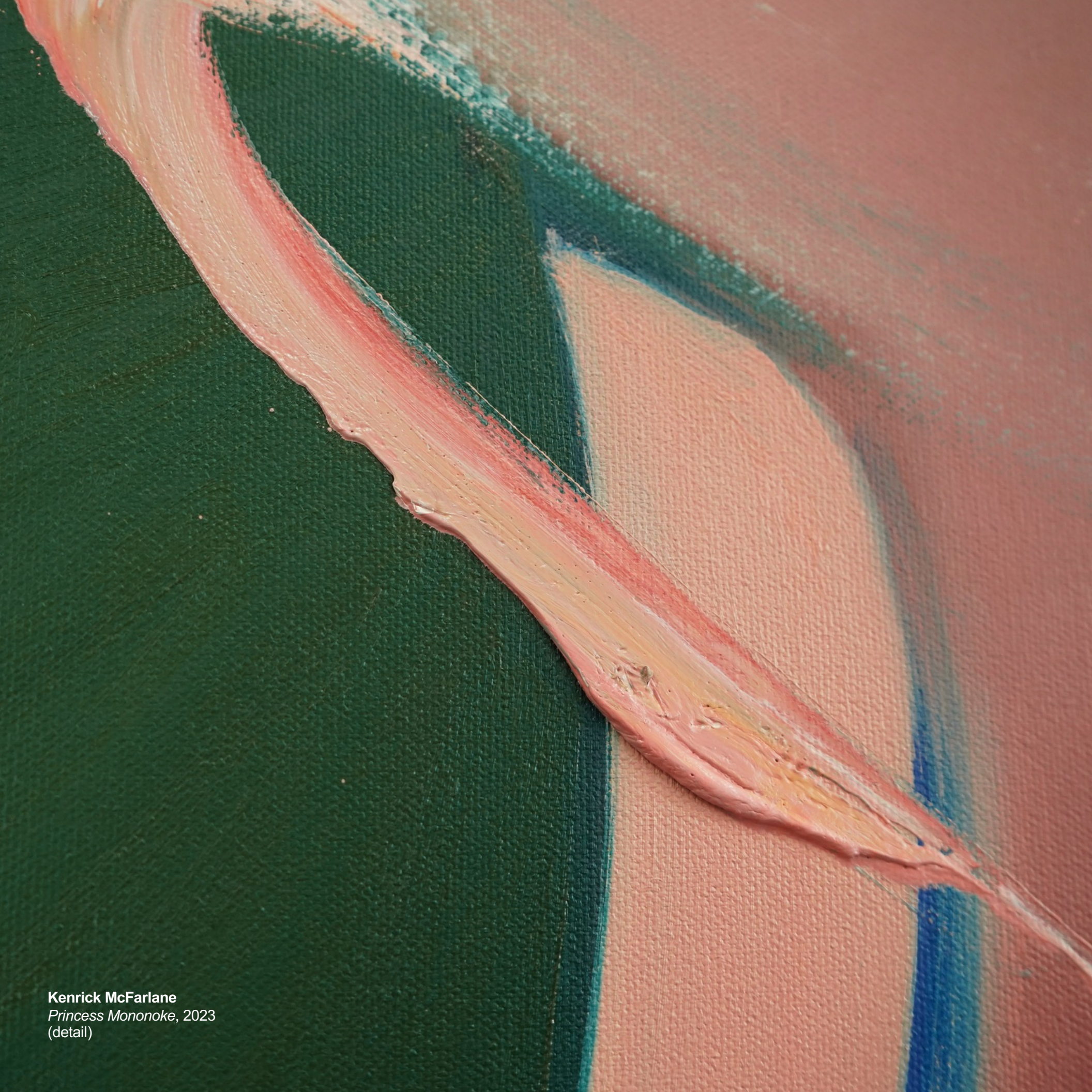
Kenrick McFarlane Princess Mononoke , 2023 (detail)