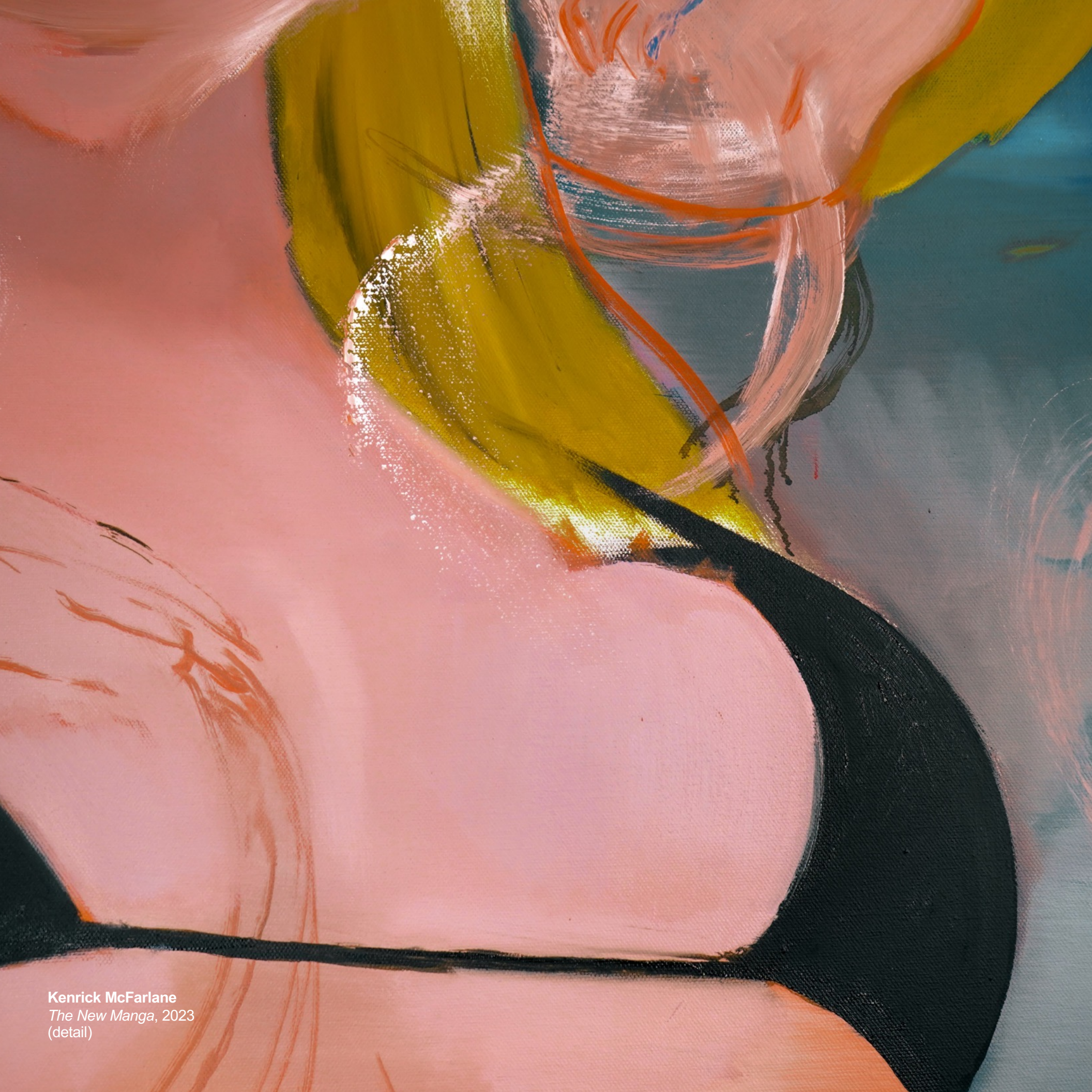
Kenrick McFarlane The New Manga, 2023 (detail)