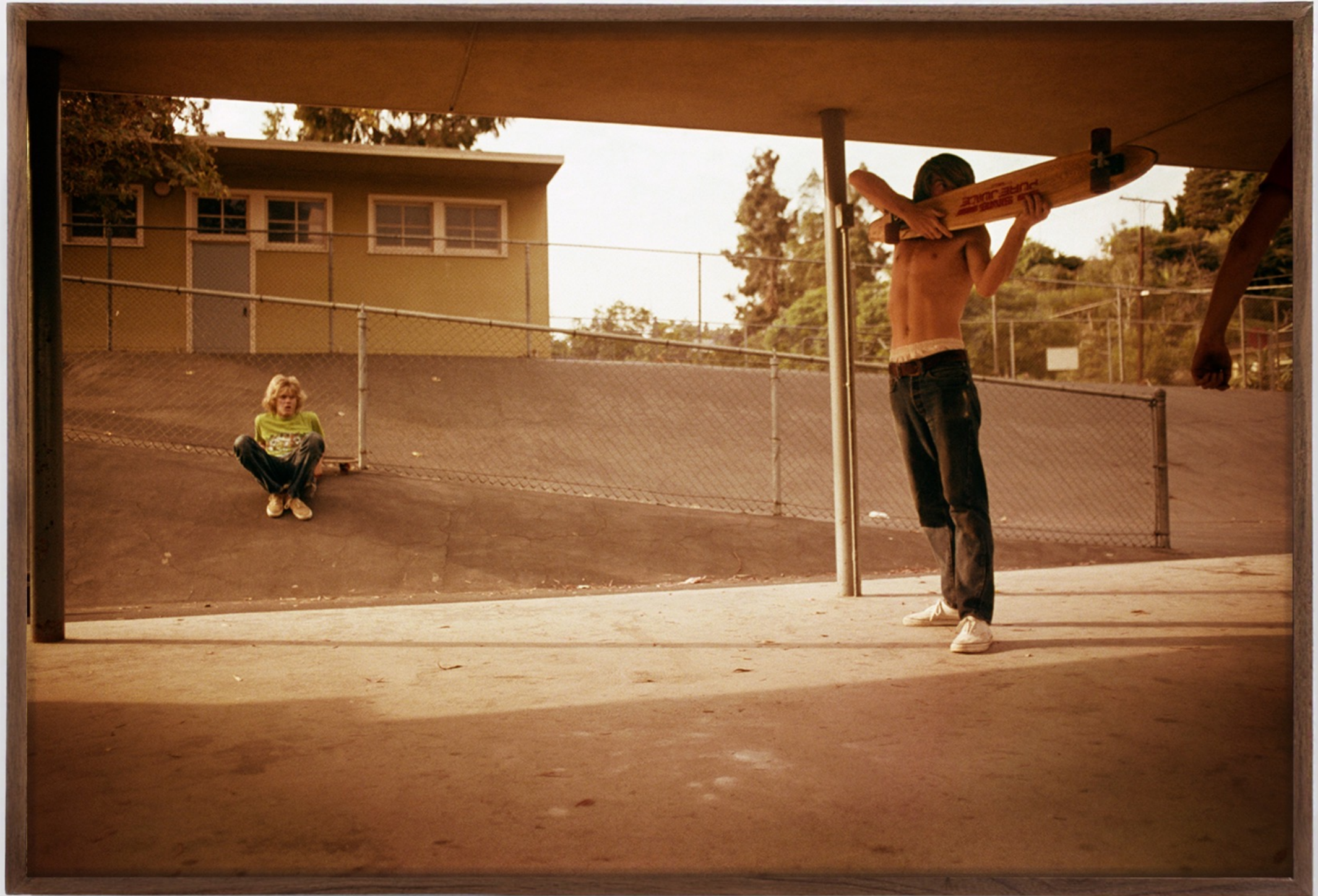
Hugh Holland | Skate Shooter, Kenter Canyon , 1976 | chromogenic print