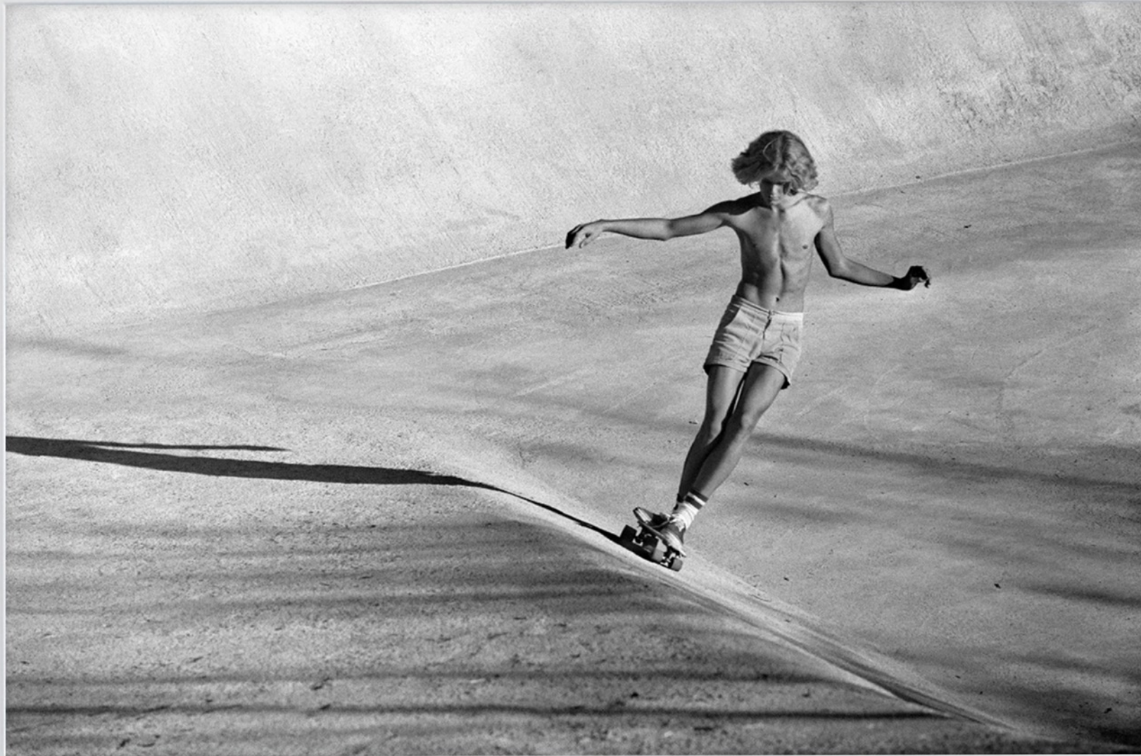
Hugh Holland | The Concrete Swell, Viper Bowl, Hollywood, CA, 1976 | gelatin silver print