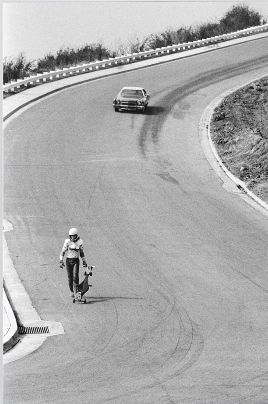
La Costa, San Diego, CA, 1975 | gelatin silver print