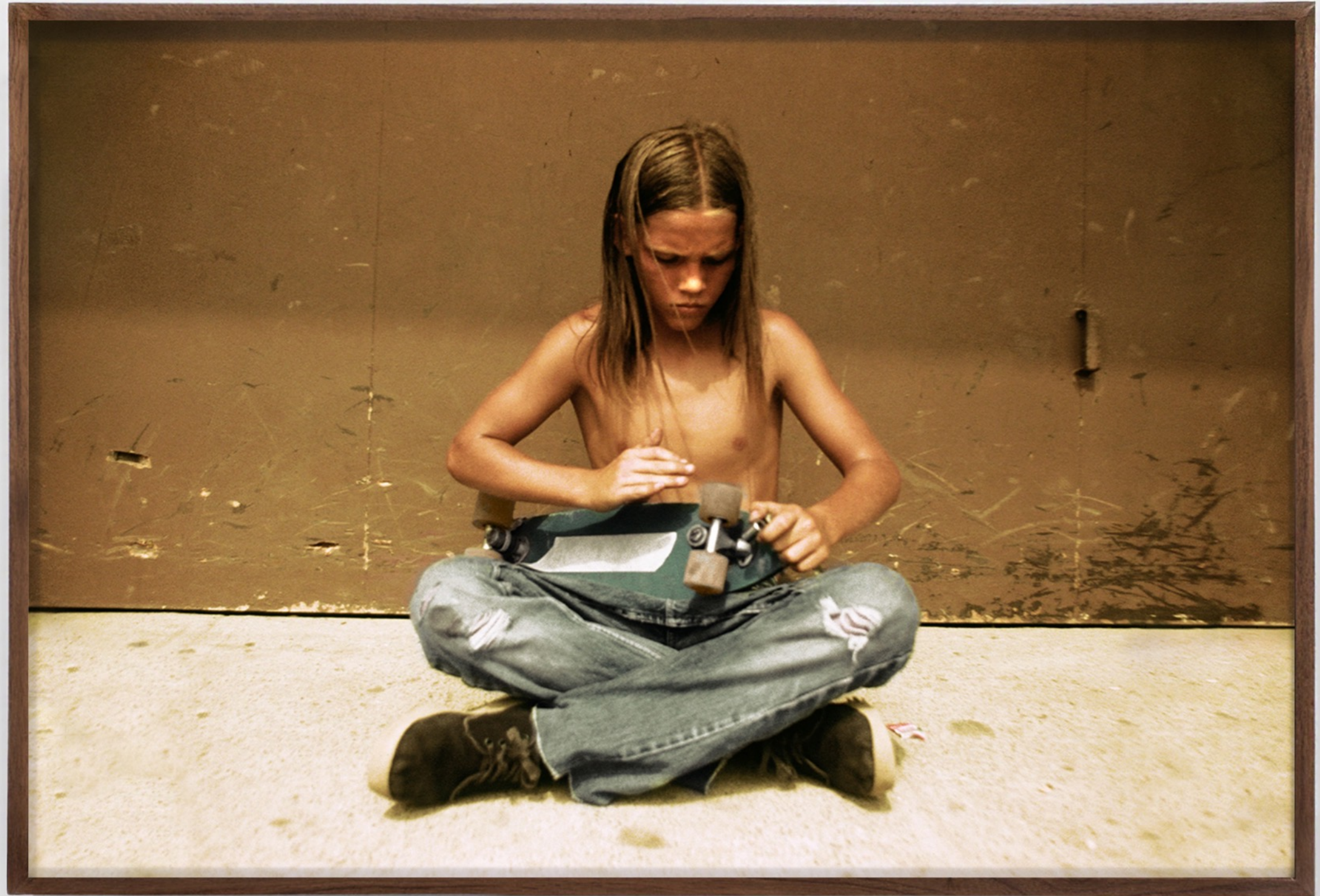
Hugh Holland | Sidewalk Surfer Pit Stop, Huntington Beach (No. 70) , 1975