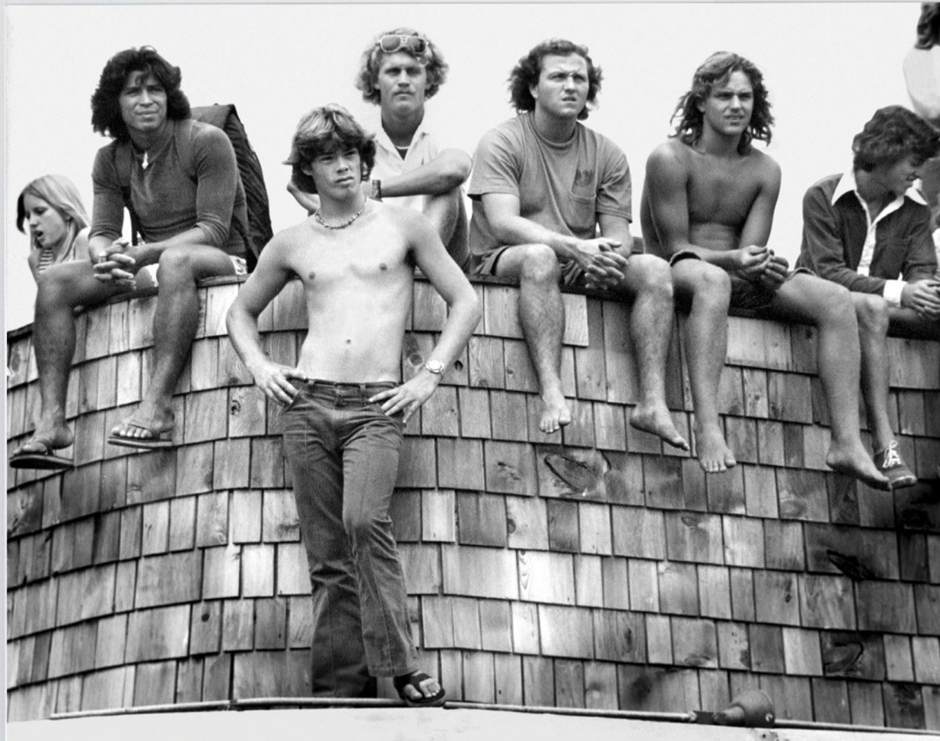
Hugh Holland | Beach Crowd, Balboa Beach, CA, 1975 | gelatin silver print