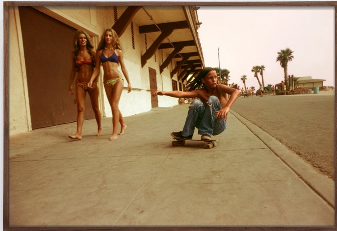
Hugh Holland | Sidewalk Surfer, Huntington Beach , 1976 | chromogenic print 36 x 48 inches | edition of 5 plus 2 AP 11 x 14 inches | edition of 15 plus 2 AP *Pricing subject to increase as edition sells