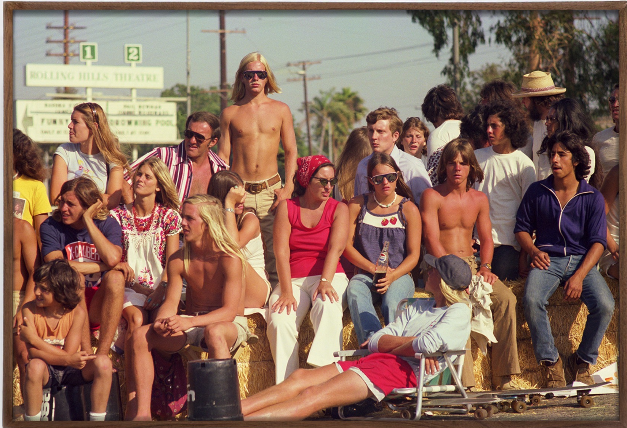
Hugh Holland | Skate Contest Spectators, Torrance (No. 62) , 1975 | chromogenic print