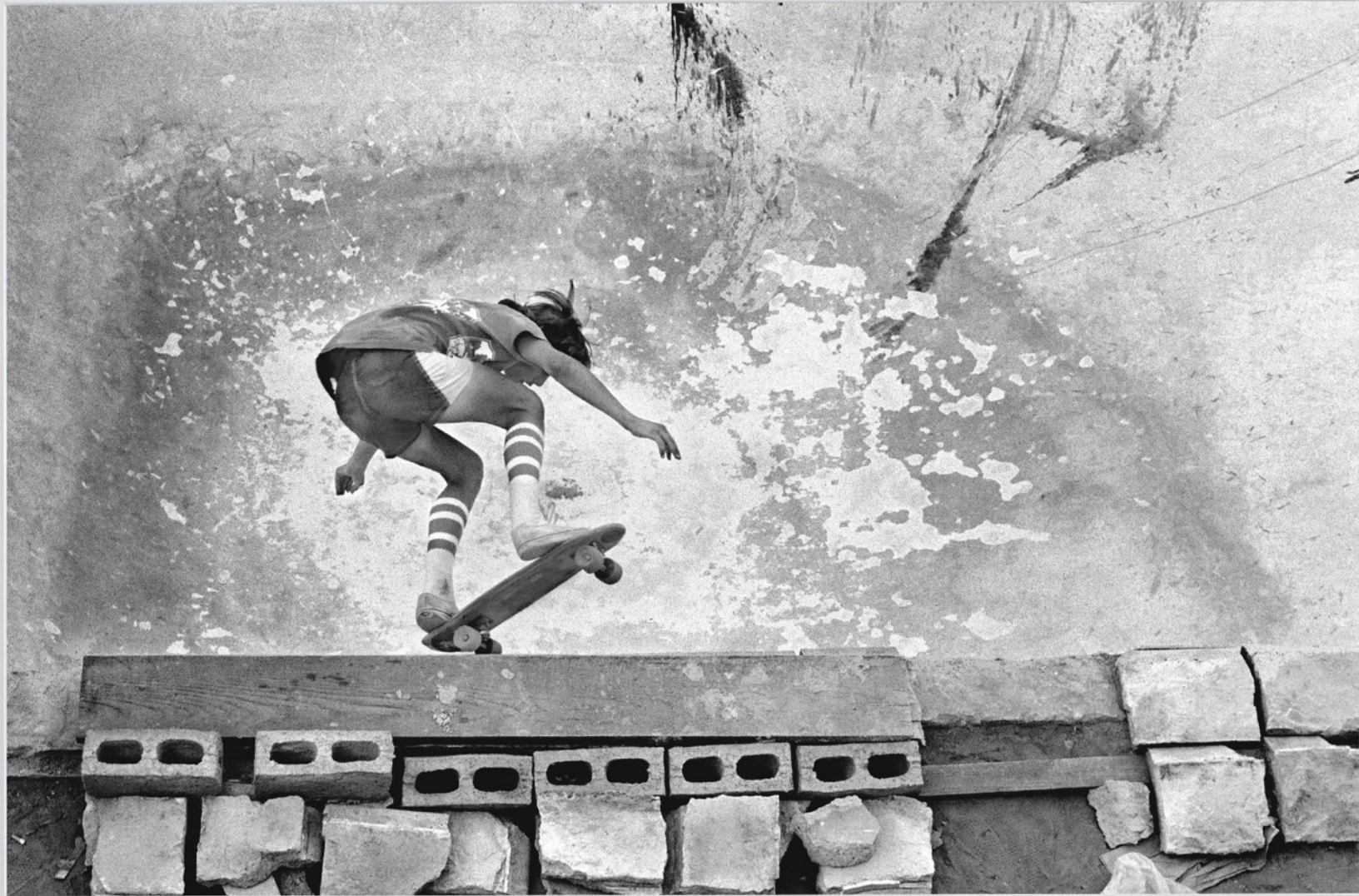
Off the Blocks, San Fernando Valley, CA, 1977 | gelatin silver print