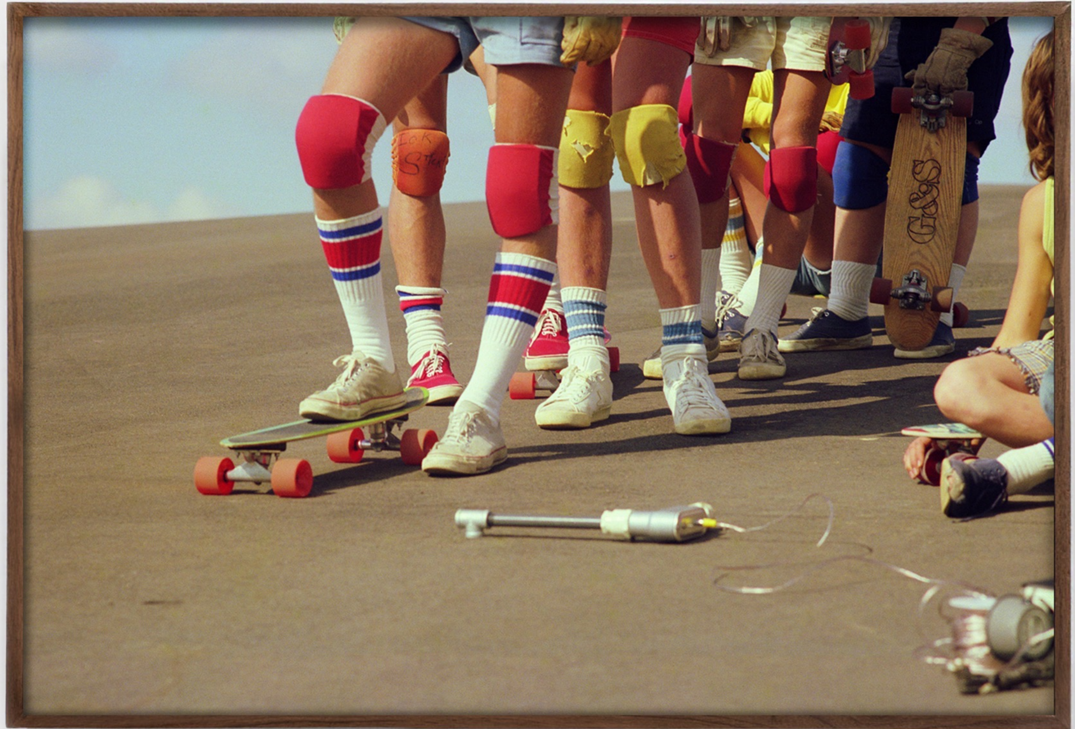
Hugh Holland | Team Line-Up (No. 60) , 1976 | chromogenic print