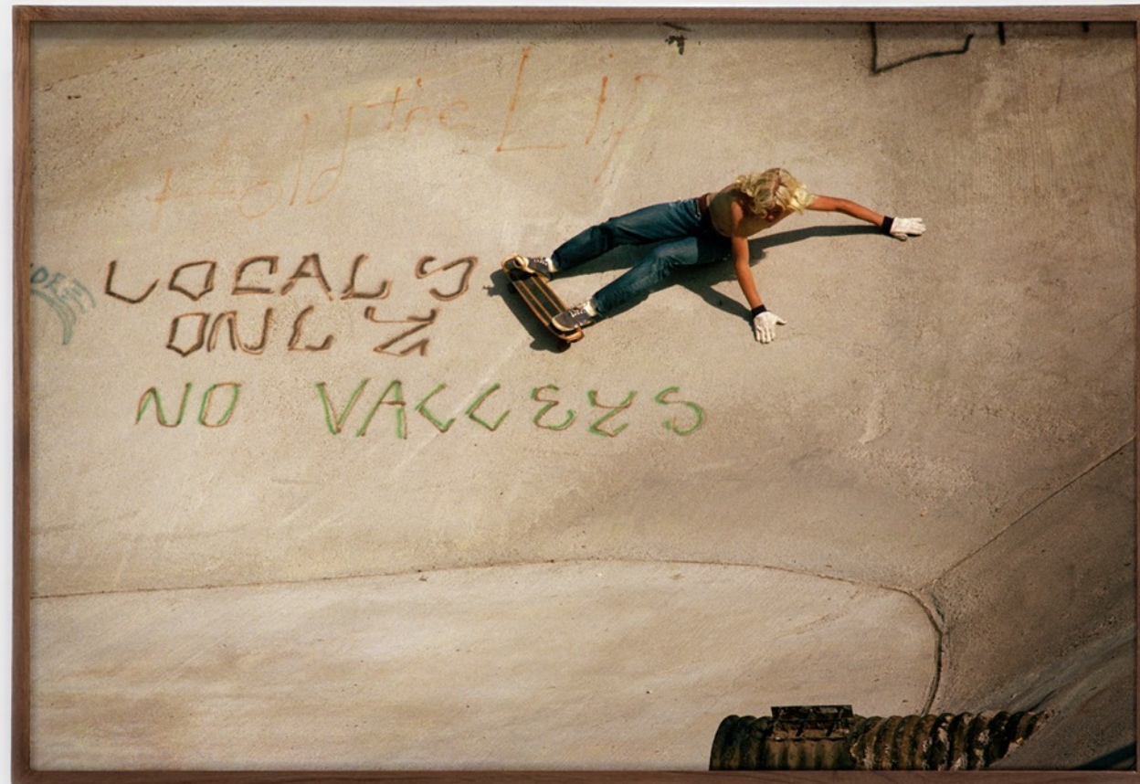
Hugh Holland | Hollywood Local , 1976 | chromogenic print