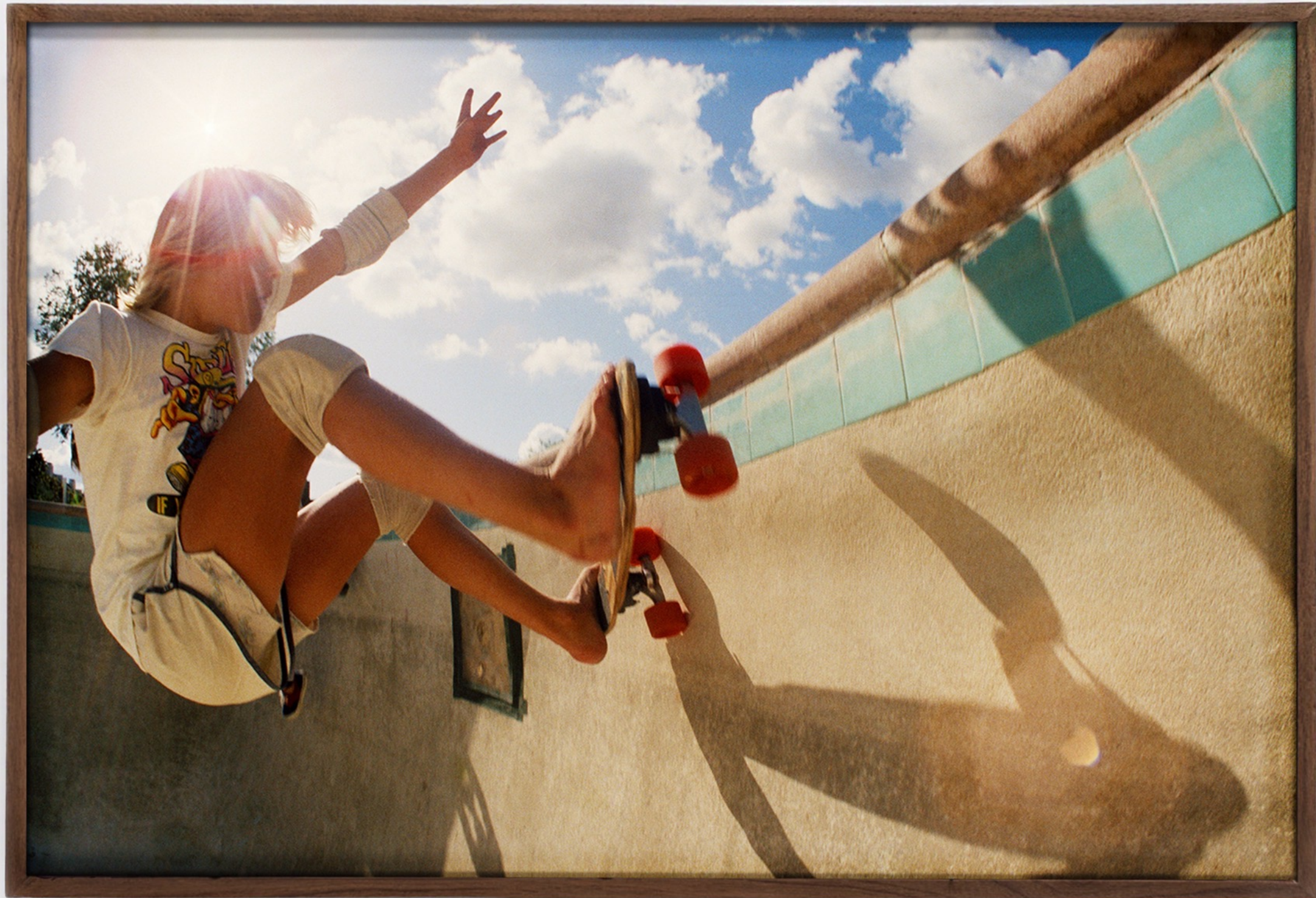
Hugh Holland | Reach Out , 1976 | chromogenic print