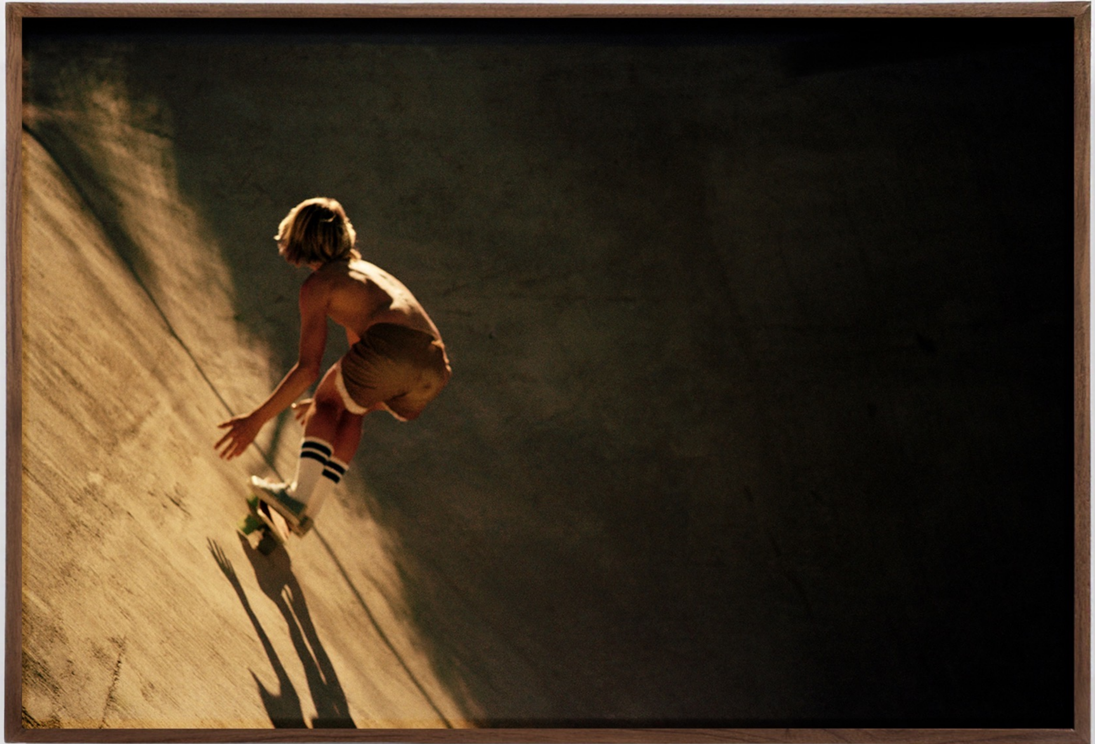
Hugh Holland | Canyon Sunset Ride, Hollywood Hills, 1975 | chromogenic print