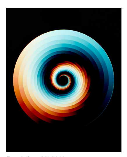
Revolutions 23, 2016