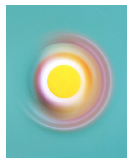
Georgia 01 (Georgia O'Keeffe, Pelvis Series - Red With Yellow, 1945), 2016