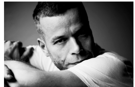
Wolfgang Tillmans

Working in a variety of genres, such as portraits, still lifes, sky photographs, astrophotography, aerial shots and landscapes, Wolfgang Tillmans managed to establish himself as one of the leading fine art photographers in Germany and worldwide. The first non-English artist to win the prestigious Turner Prize, he initially started taking snapshots of his friends, but perhaps he's most famous for his stunning abstract photography, either created as a result of technical and chemical experimentations in the darkroom, as collages, or the print of a monochrome laser copier. In fact, the imagery made in the darkroom are the most captivating ones, as they evoke the very essence of an abstraction by creating the idea from scratch, rather than modifying reality.