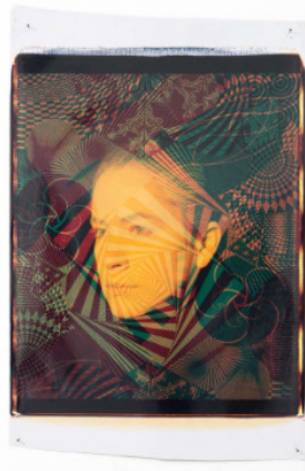
Self-Portrait, 1987. Unique 20 x 24 Polaroid © Ellen Carey