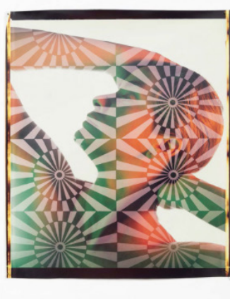
Self-Portrait, 1984. Unique 20 x 24 Polaroid © Ellen Carey