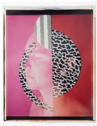
Portrait, 1985. Unique 20 x 24 Polaroid © Ellen Carey