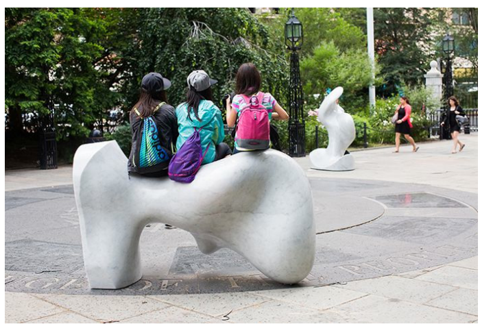
Jon Rafman New Age Demanded (Curveman Carrara), 2015 New Age Demanded (Elegante Carrara), 2015 Marble

I didn't notice the term "post-Internet art" cropping up in any of the explanatory text surrounding this exhibition, but I was curious as to your thoughts on what that term even means. Like "postmodern," it seems as if everyone has their own definition.