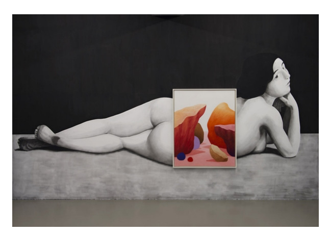
Nicolas Party, Pastel et Nu (2015).