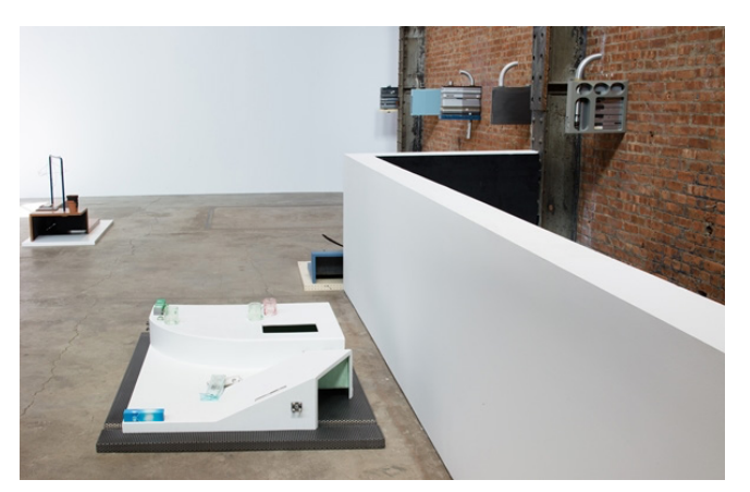
Installation view, Magali Reus: Spring for a Ground, SculptureCenter, 2015