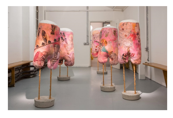
Athena Papadopoulos, installation view.