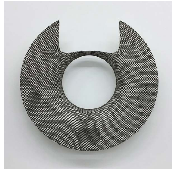
Yngve Holen, World of Hope (2015).