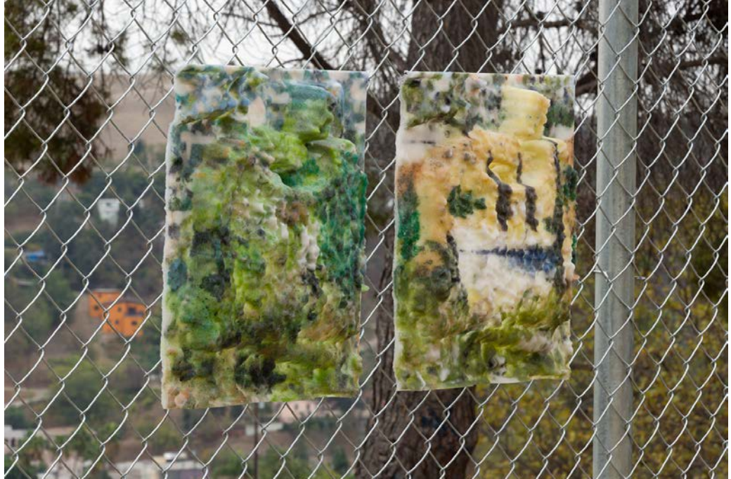
Ernest E. Debs Regional Park 4248 Roberta Street, Los Angeles, California 90031 November 1 – 3, 2014