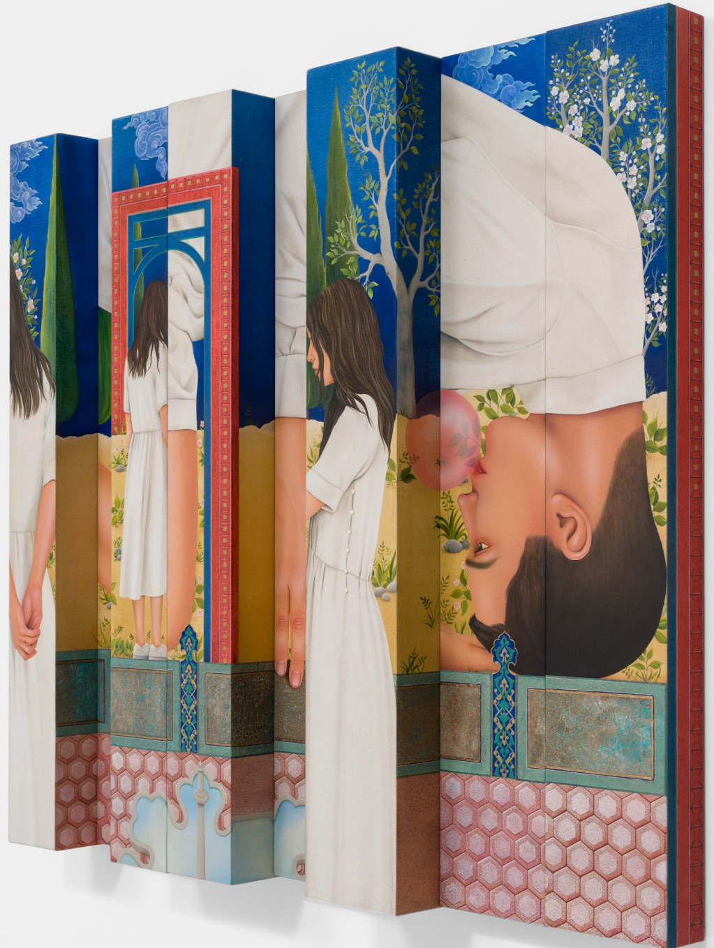
Arghavan Khosravi Parallel Lives (2) , 2020