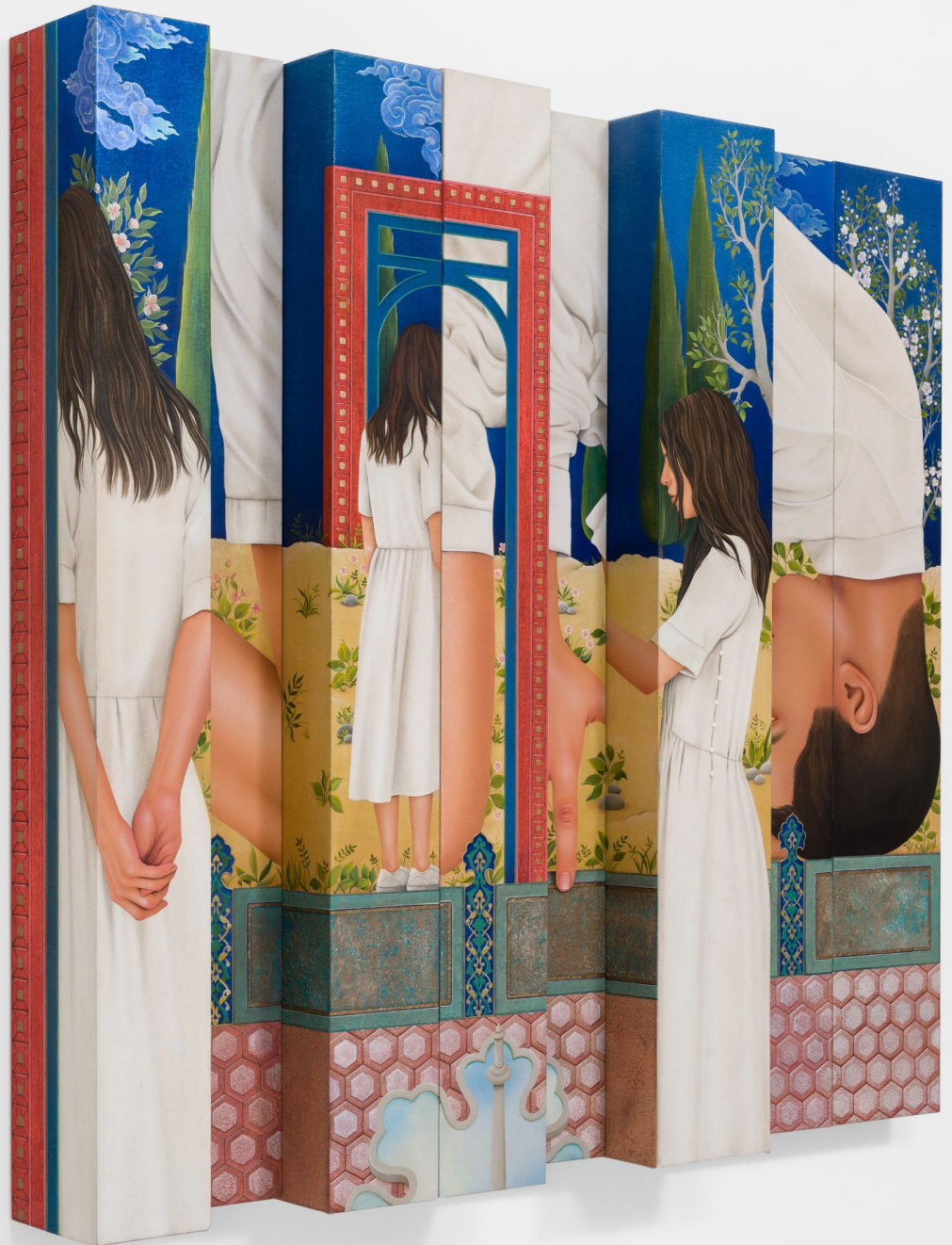
Arghavan Khosravi Parallel Lives (2) , 2020