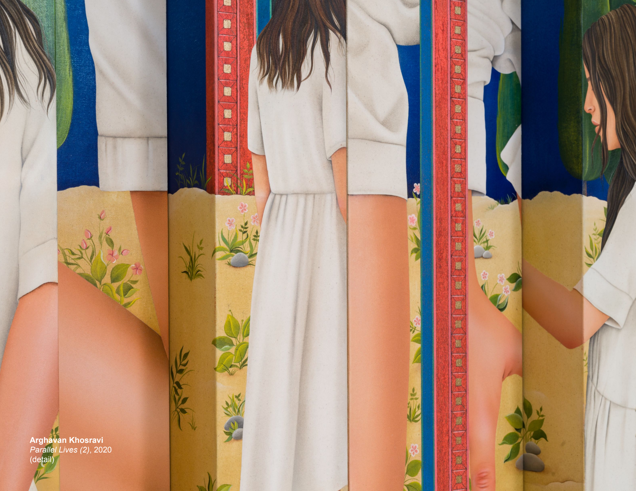
Arghavan Khosravi Parallel Lives (2) , 2020 (detail)