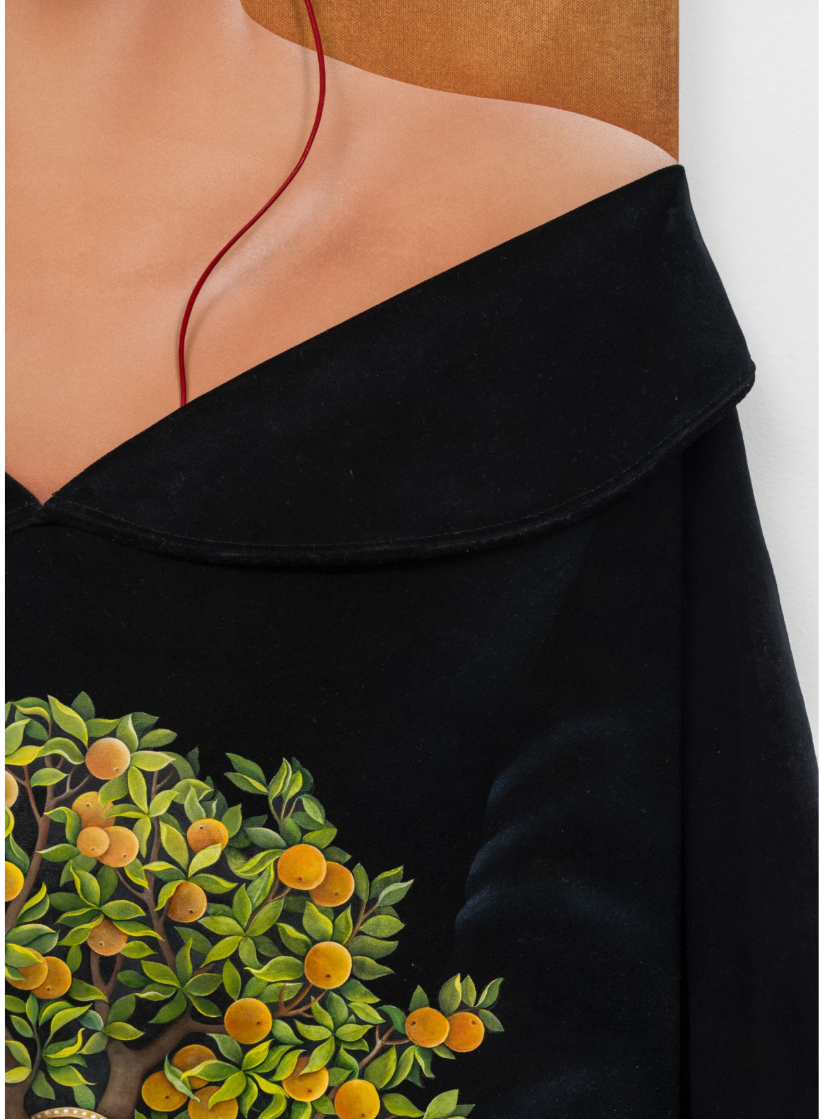
Arghavan Khosravi Eye Witness , 2019 (detail)