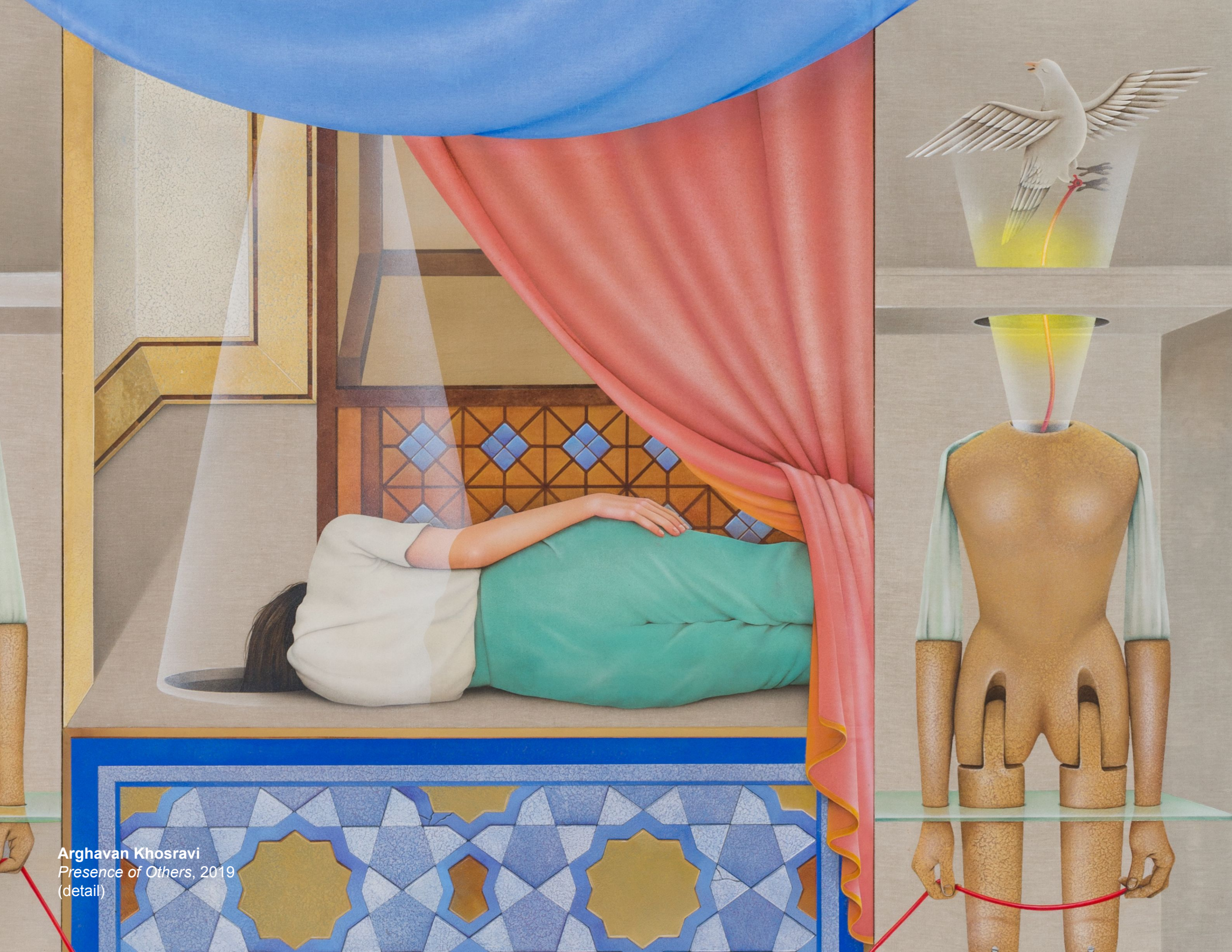
Arghavan Khosravi Presence of Others , 2019 (detail)