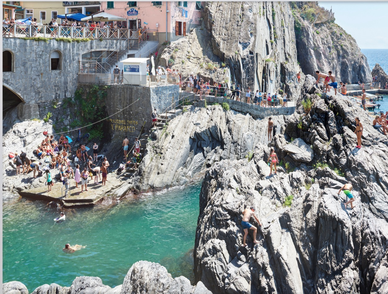
Massimo Vitali | Manarola Paranco , 2020 chromogenic print with Diasec mount in artist frame 70 7/8 inches x 86 5/8 (180 x 220 cm) or 59 x 74 3/4 inches (150 x 190 cm) edition of 6 plus 2 artist's proofs