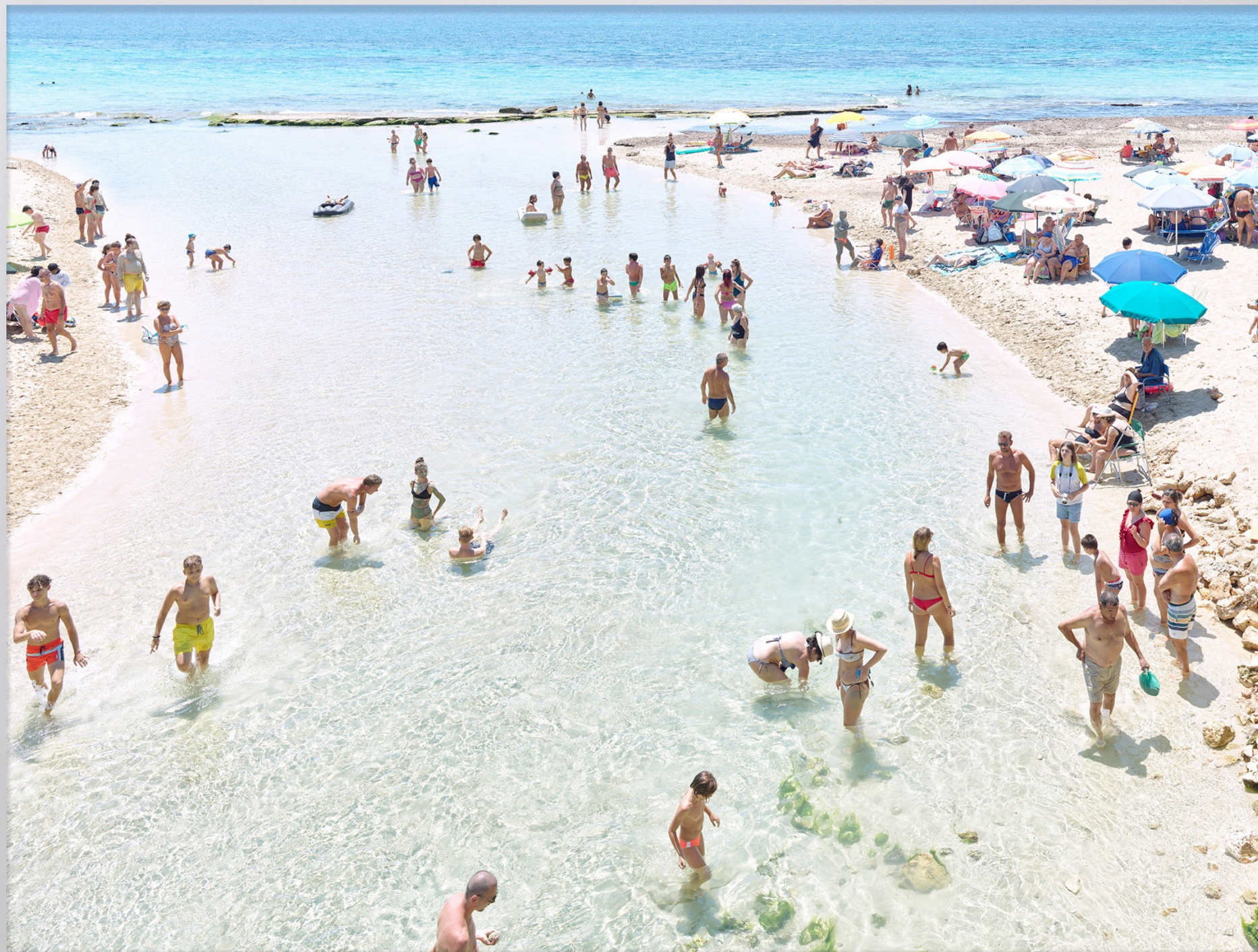
Massimo Vitali | Chidro Esse , 2020 chromogenic print with Diasec mount in artist frame 70 7/8 inches x 86 5/8 (180 x 220 cm) or 59 x 74 3/4 inches (150 x 190 cm) edition of 6 plus 2 artist's proofs