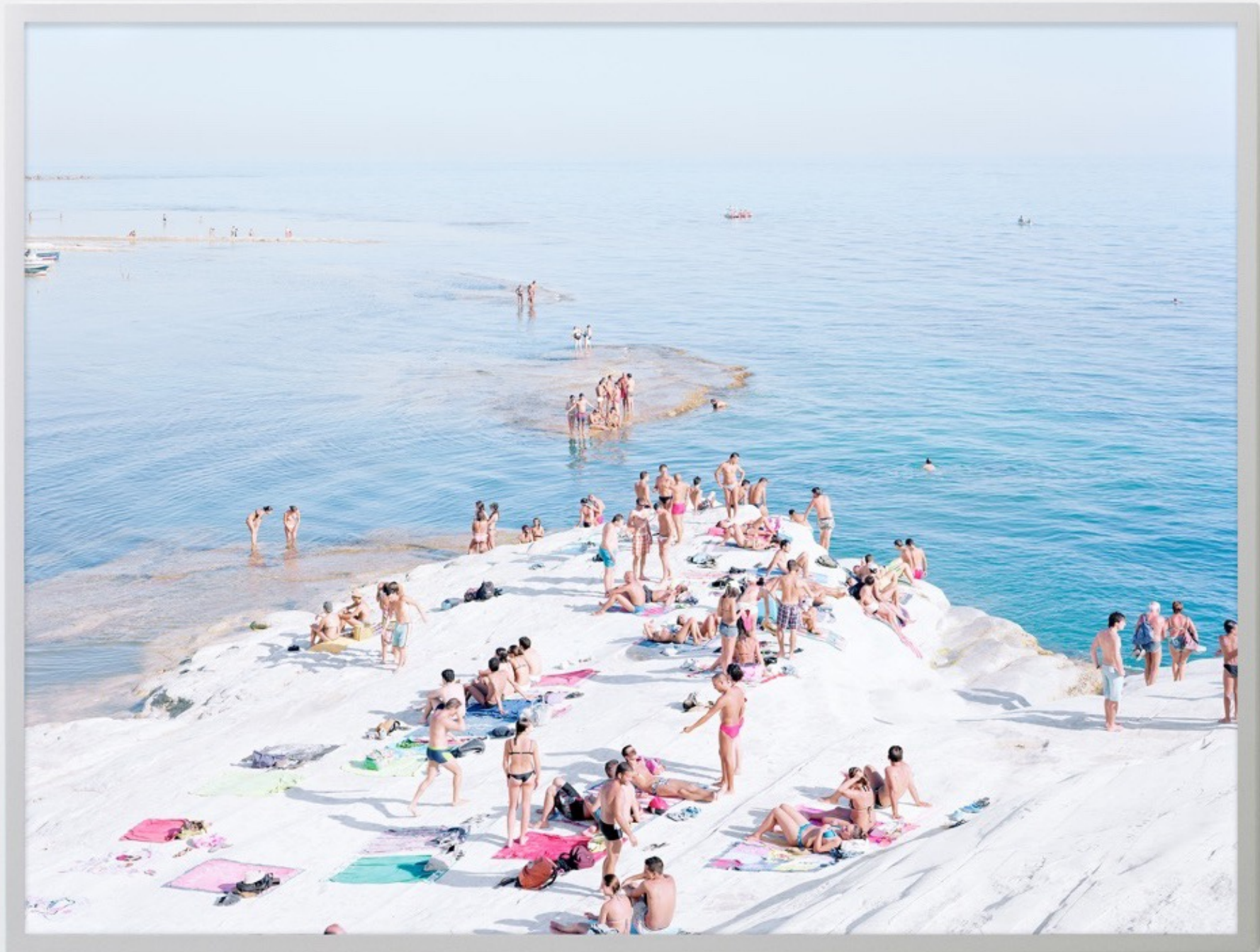
Massimo Vitali | SDT Island 3 , 2009 chromogenic print with Diasec mount in artist frame 70 7/8 inches x 86 5/8 (180 x 220 cm) or 59 x 74 3/4 inches (150 x 190 cm) edition of 6 plus 2 artist's proofs