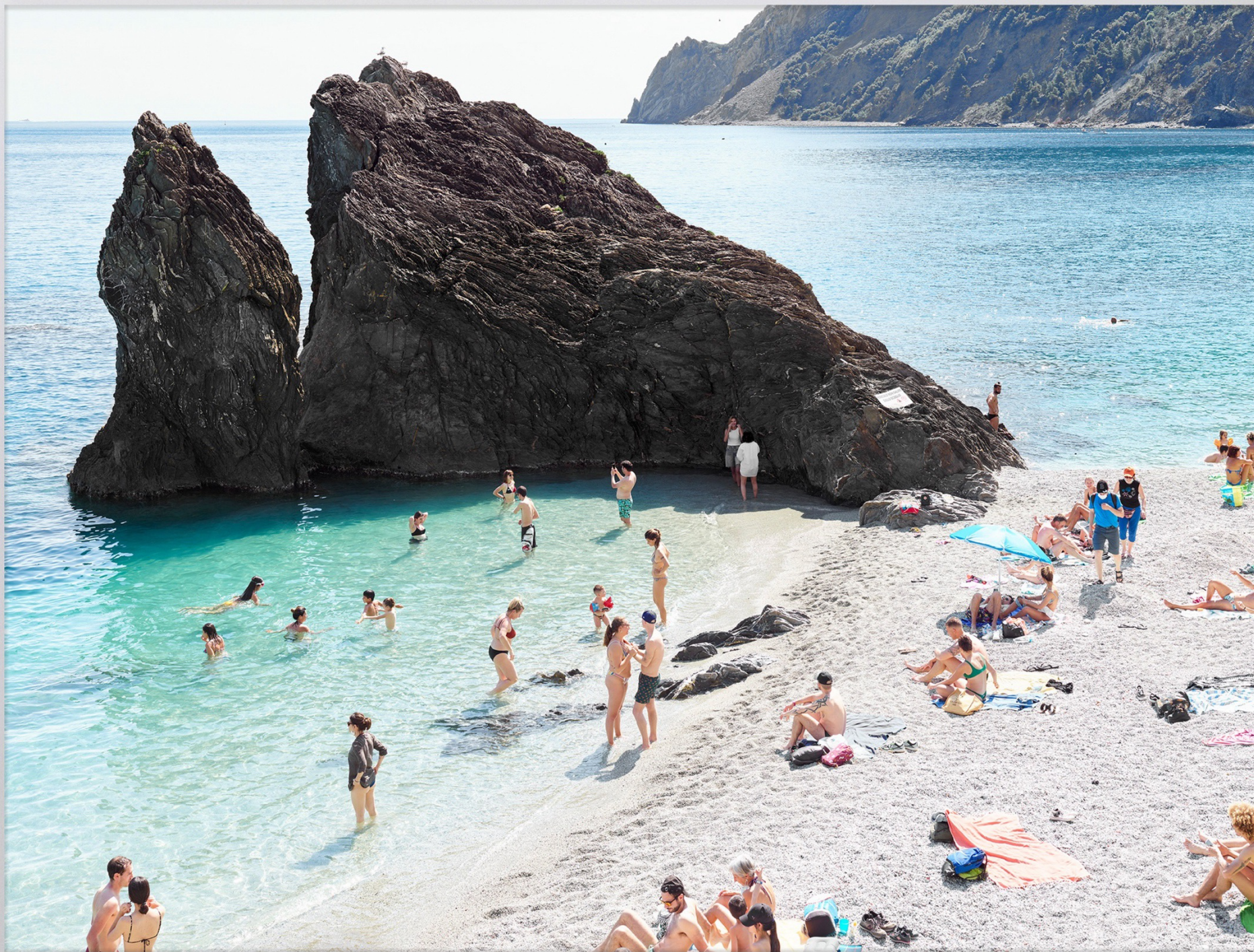
Massimo Vitali | Monterosso Photo Session , 2021 chromogenic print with Diasec mount in artist frame 70 7/8 inches x 86 5/8 (180 x 220 cm) or 59 x 74 3/4 inches (150 x 190 cm) edition of 6 plus 2 artist's proofs