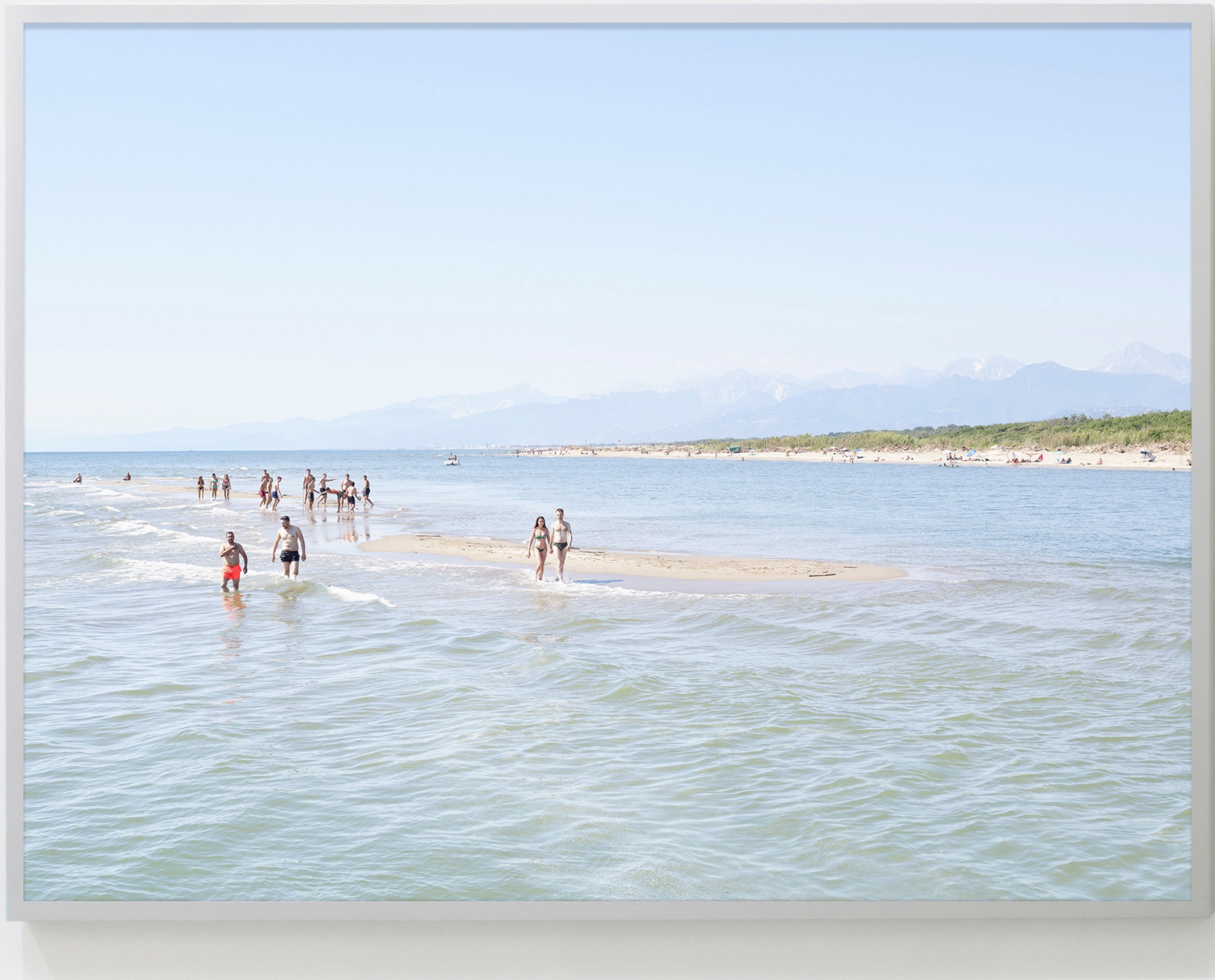
Massimo Vitali | Foce del Serchio Couples , 2020 chromogenic print with Diasec mount in artist frame 70 7/8 inches x 86 5/8 (180 x 220 cm) or 59 x 74 3/4 inches (150 x 190 cm) edition of 6 plus 2 artist's proofs