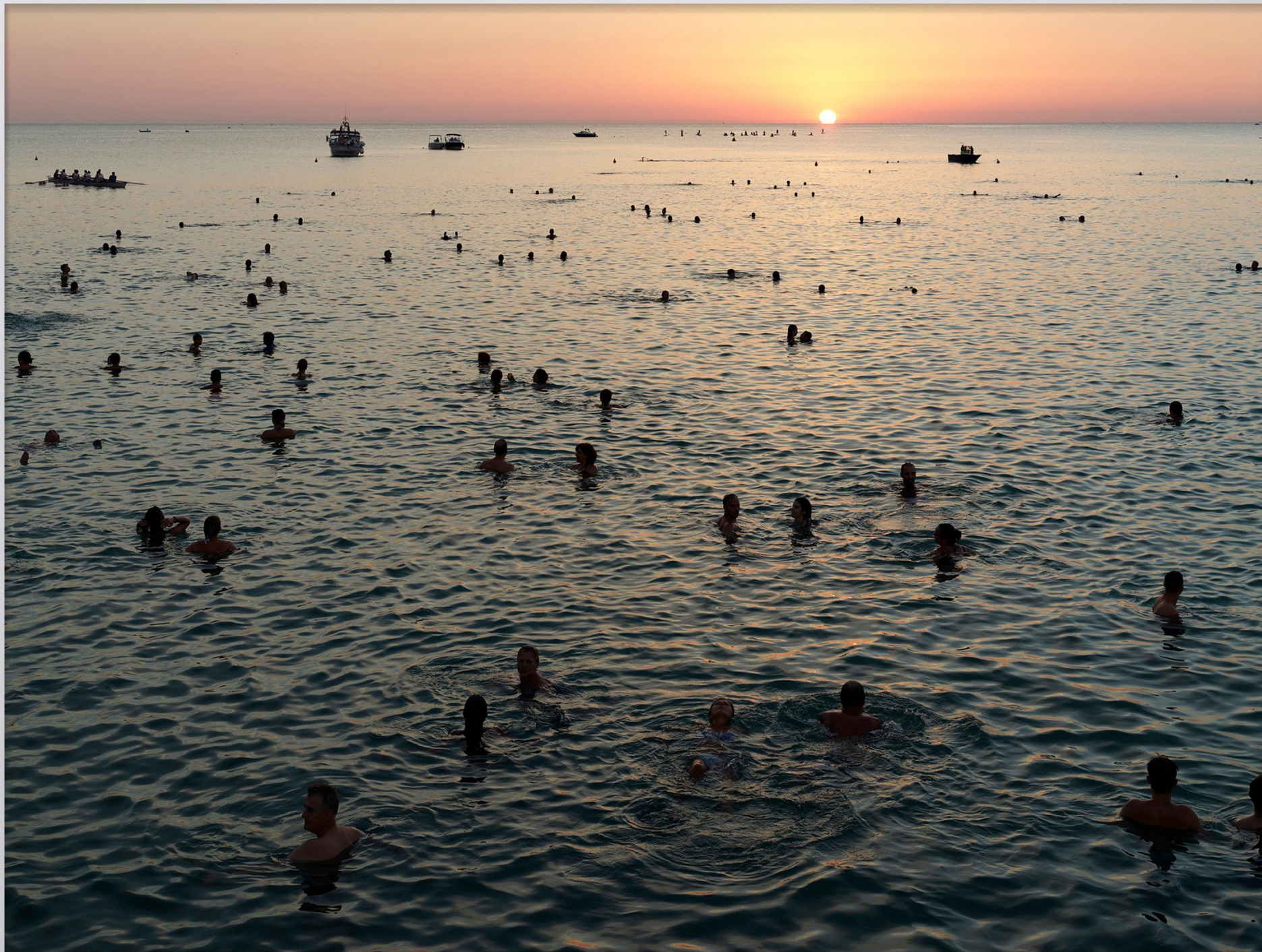
Massimo Vitali | Monopoli Sunrise , 2022 chromogenic print with Diasec mount in artist frame 70 7/8 inches x 86 5/8 (180 x 220 cm) or 59 x 74 3/4 inches (150 x 190 cm) edition of 6 plus 2 artist's proofs