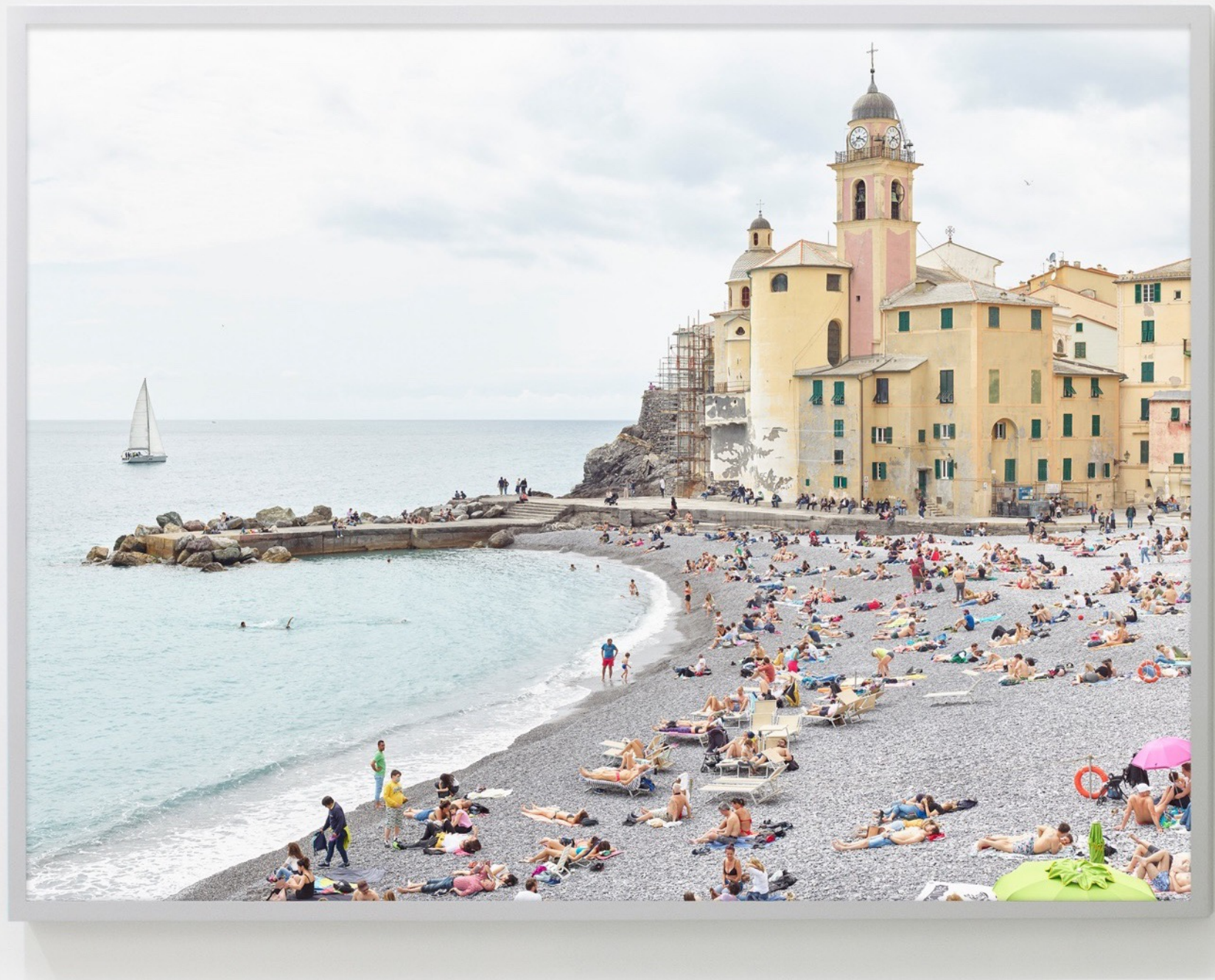
Massimo Vitali | Camogli Boat , 2021 chromogenic print with Diasc mount in artist frame 70 7/8 inches x 86 5/8 (180 x 220 cm) or 59 x 74 3/4 inches (150 x 190 cm) edition of 6 plus 2 artist's proofs