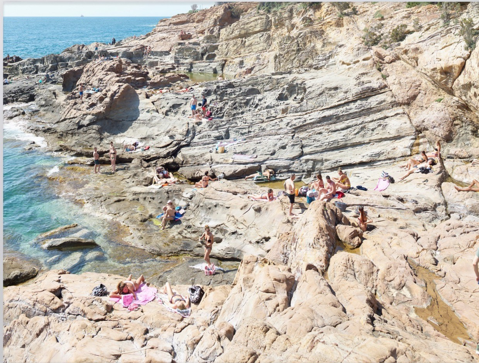
Massimo Vitali | Livorno Le Vaschette Facing North , 2020 chromogenic print with Diassec mount in artist frame 70 7/8 inches x 86 5/8 (180 x 220 cm) or 59 x 74 3/4 inches (150 x 190 cm) edition of 6 plus 2 artist's proofs