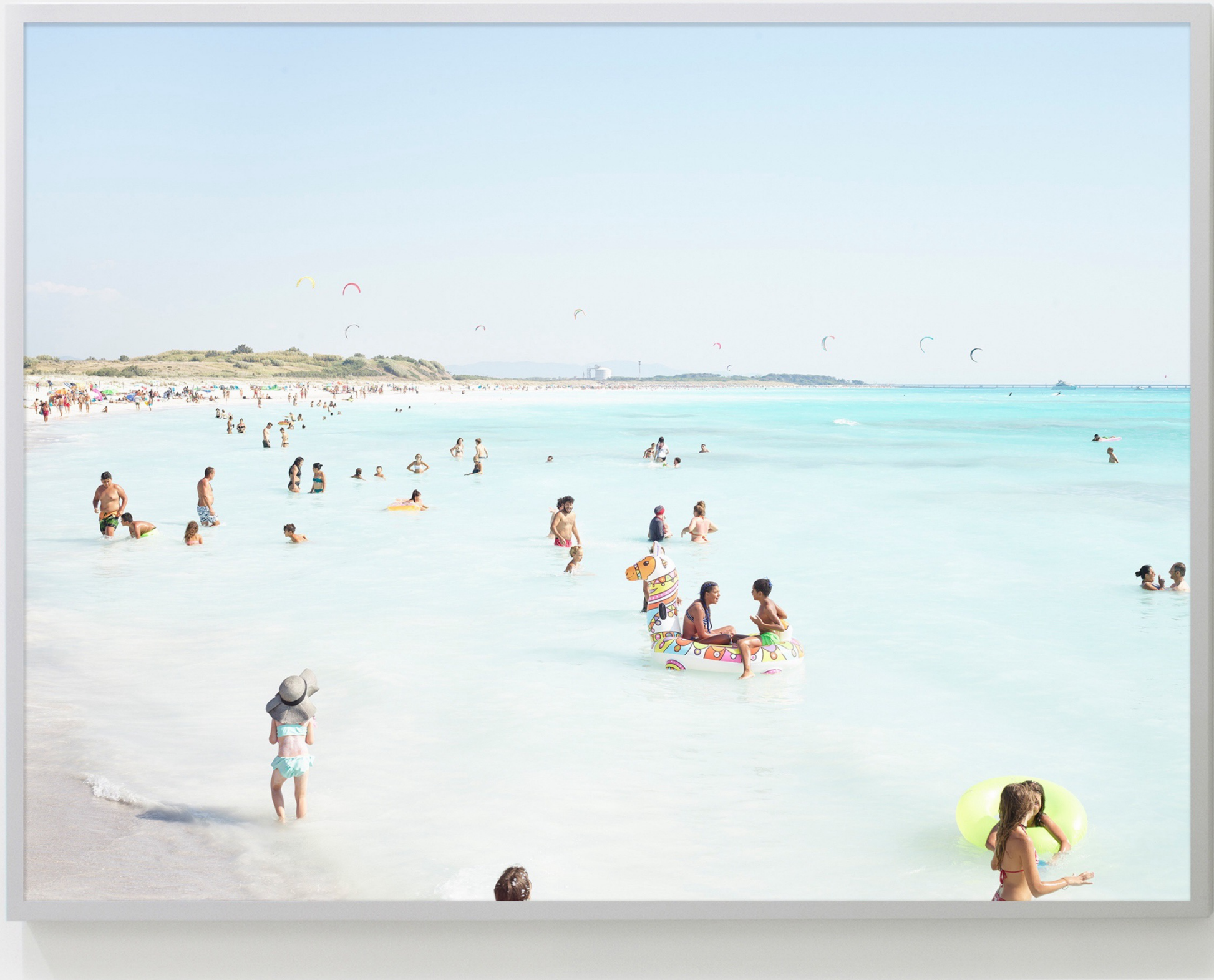
Massimo Vitali | Rosignano Multi-ethnic , 2020 chromogenic print with Diasec mount in artist frame 70 7/8 inches x 86 5/8 (180 x 220 cm) or 59 x 74 3/4 inches (150 x 190 cm) edition of 6 plus 2 artist's proofs