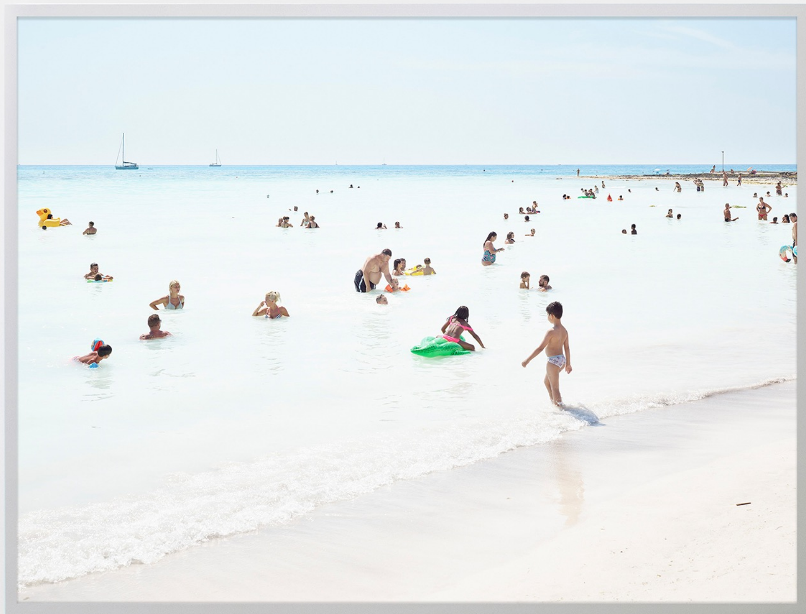
Massimo Vitali | Rosignano Milk Buzza , 2020 chromogenic print with Diasec mount in artist frame 70 7/8 inches x 86 5/8 (180 x 220 cm) or 59 x 74 3/4 inches (150 x 190 cm) edition of 6 plus 2 artist's proofs