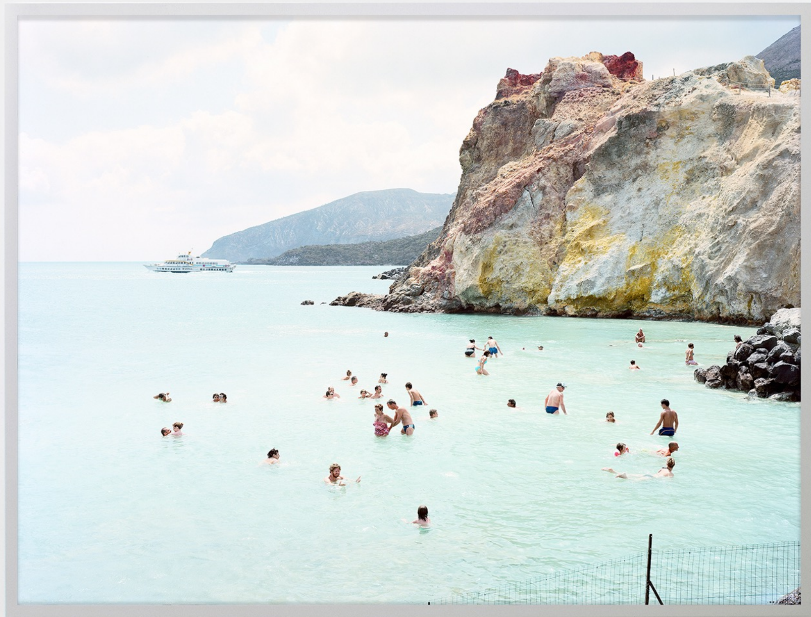
Massimo Vitali | Vulcano Sea Ferry , 2008 chromogenic print with Diasec mount in artist frame 70 7/8 inches x 86 5/8 (180 x 220 cm) or 59 x 74 3/4 inches (150 x 190 cm) edition of 6 plus 2 artist's proofs