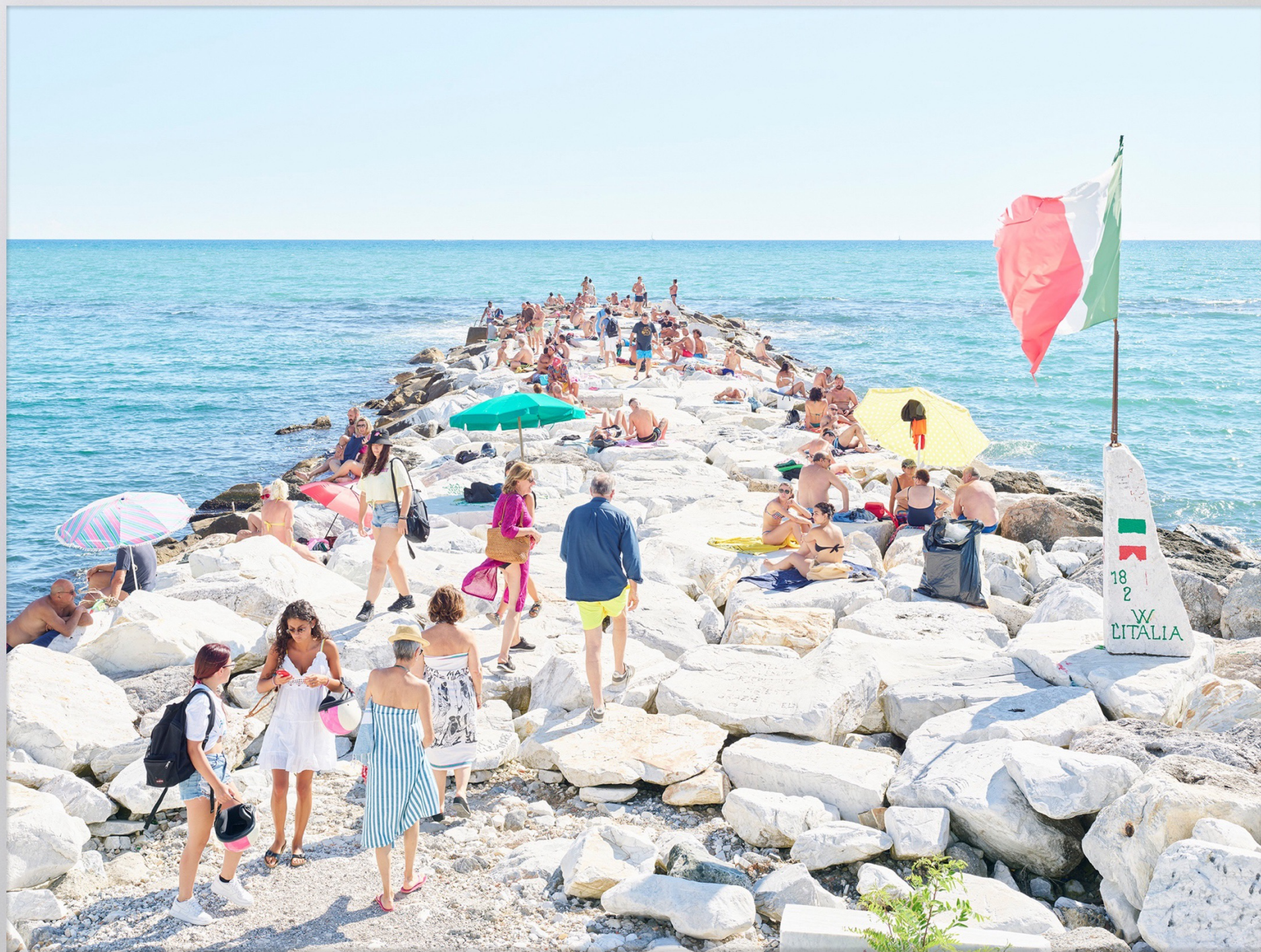
Massimo Vitali | Marina di Massa Pontile dell'Amore Italia , 2020 chromogenic print with Diasec mount in artist frame 70 7/8 inches x 86 5/8 (180 x 220 cm) or 59 x 74 3/4 inches (150 x 190 cm) edition of 6 plus 2 artist's proofs