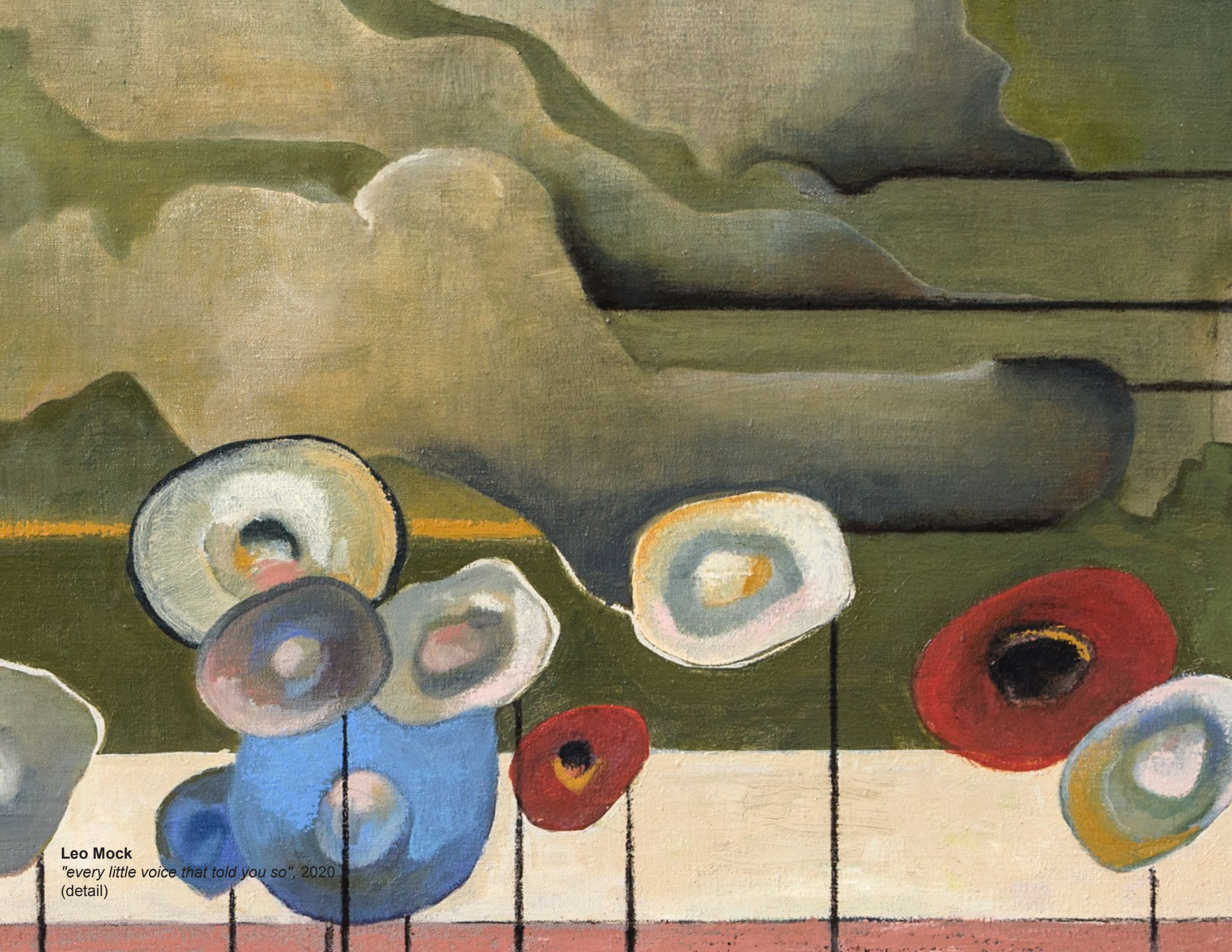
Leo Mock "every little voice that told you so", 2020 (detail)