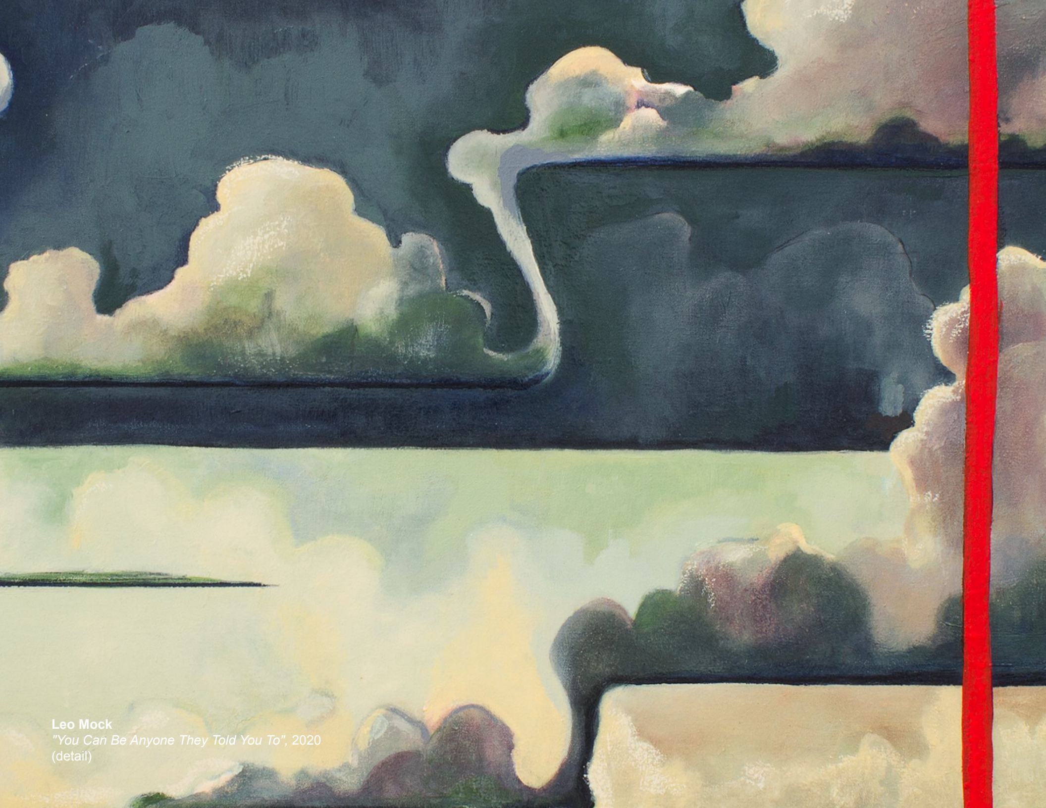
Leo Mock "You Can Be Anyone They Told You To", 2020 (detail)