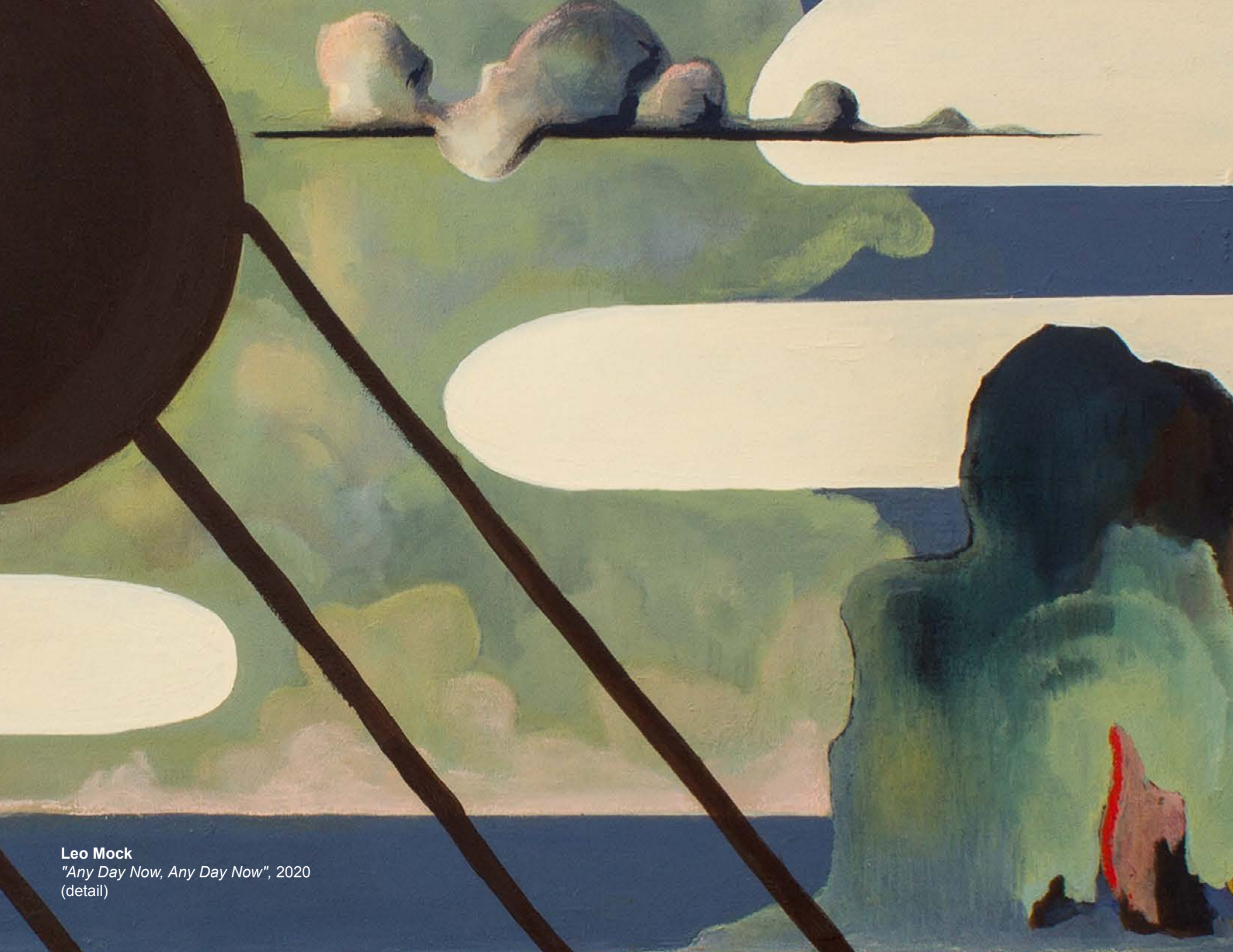
Leo Mock "Any Day Now, Any Day Now" , 2020 (detail)