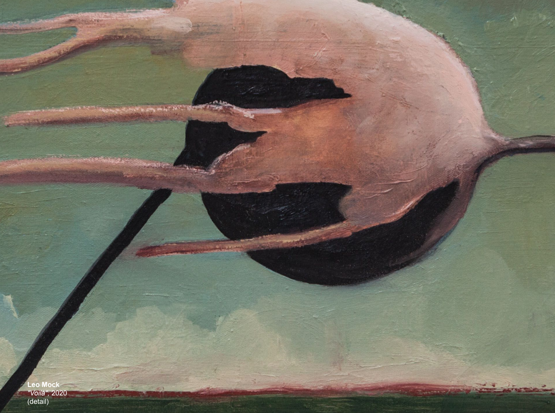
Leo Mock "Voilà", 2020 (detail)