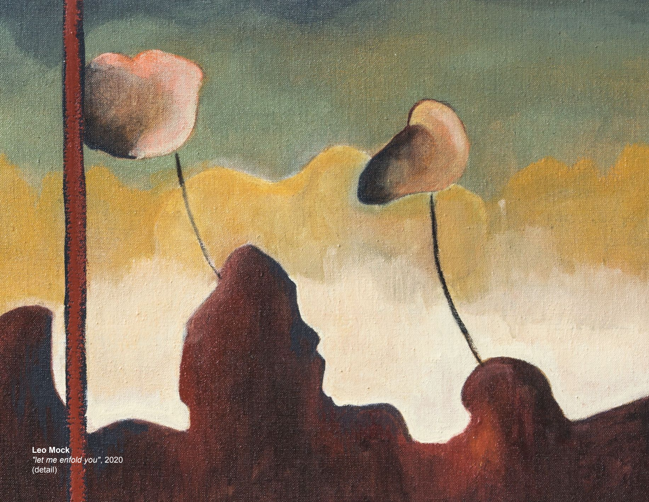
Leo Mock "let me enfold you" , 2020 (detail)