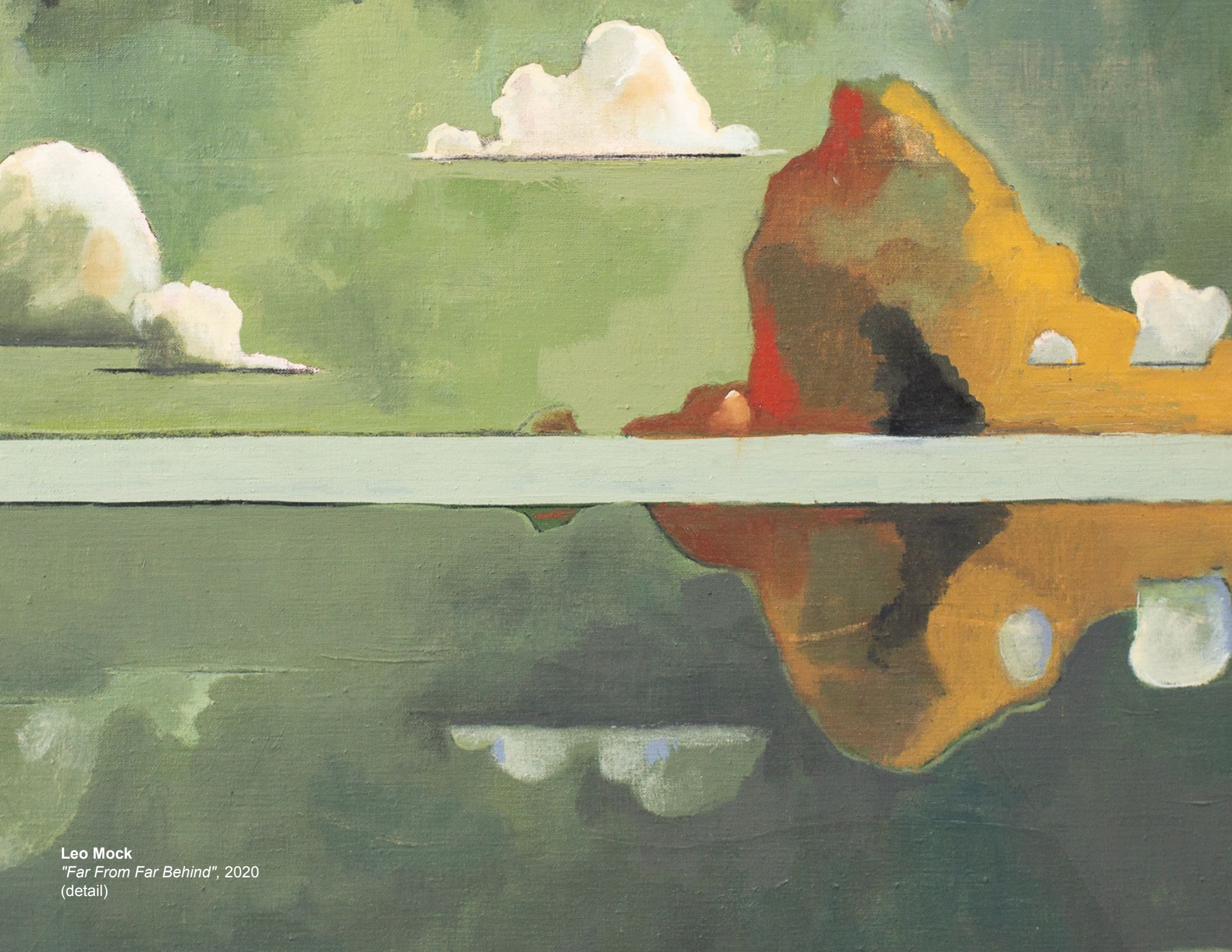
Leo Mock "Far From Far Behind" , 2020 (detail)