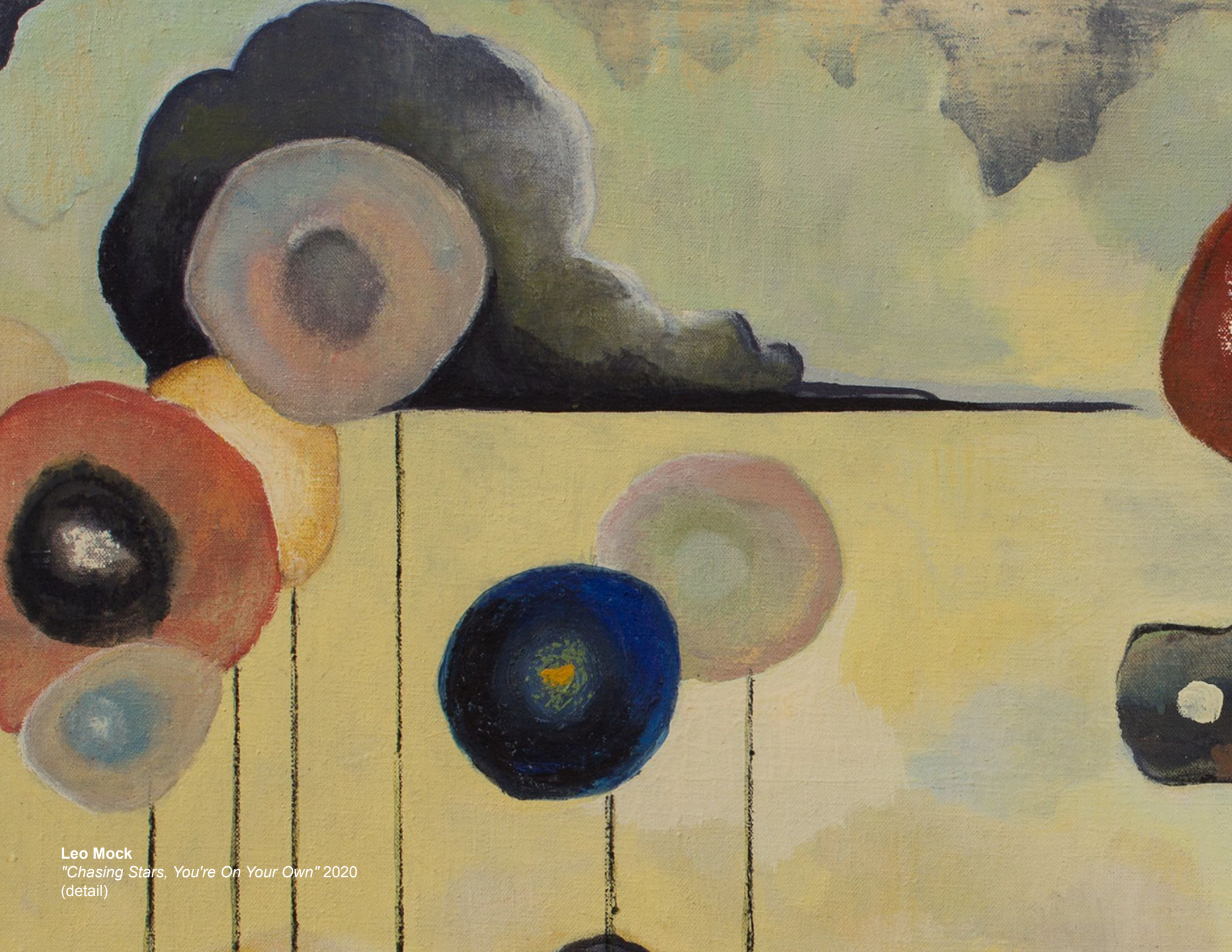
Leo Mock "Chasing Stars, You're On Your Own" 2020 (detail)