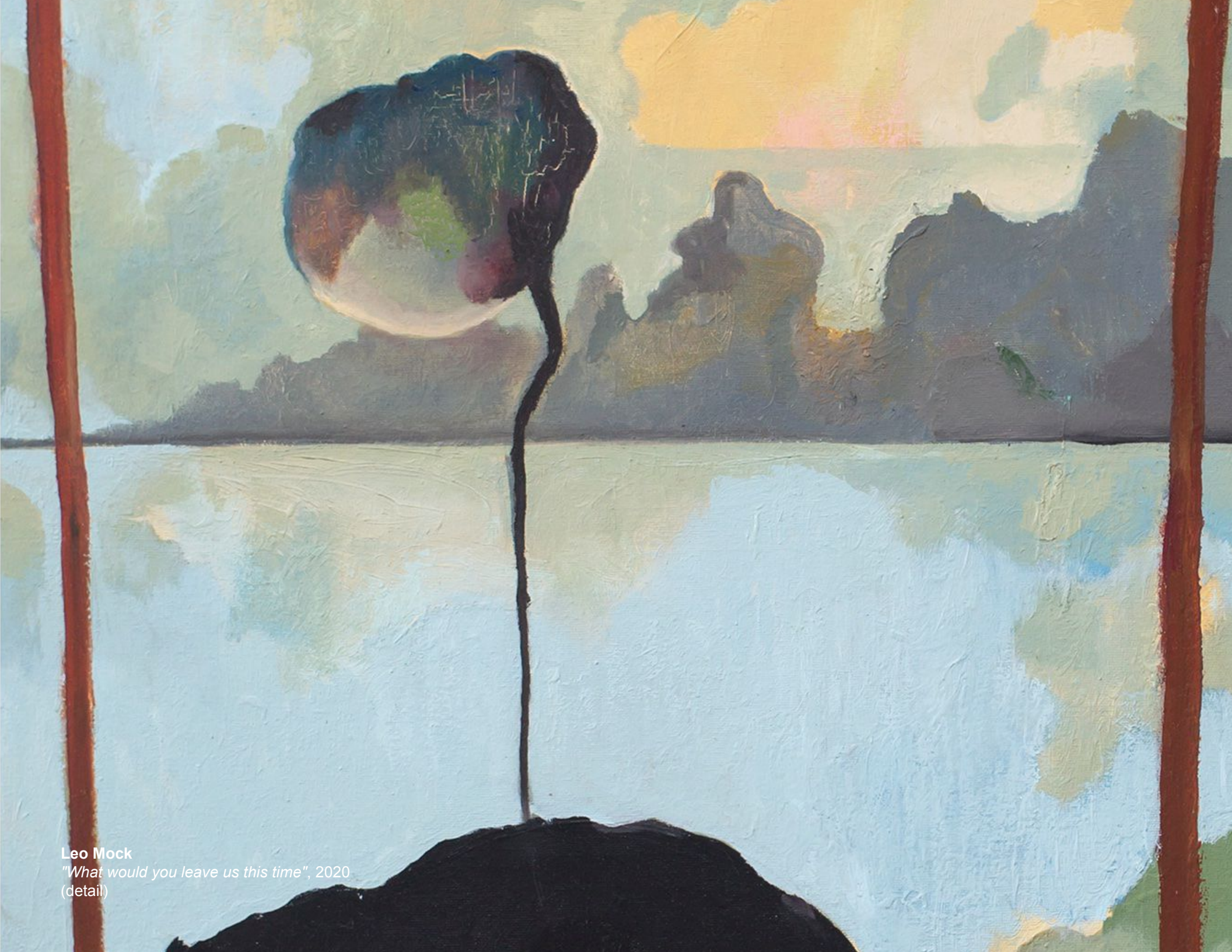
Leo Mock "What would you leave us this time" , 2020 (detail)