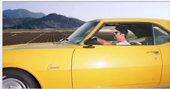
Andrew Bush | Installation view with 30 x 40 inch Vector Portraits