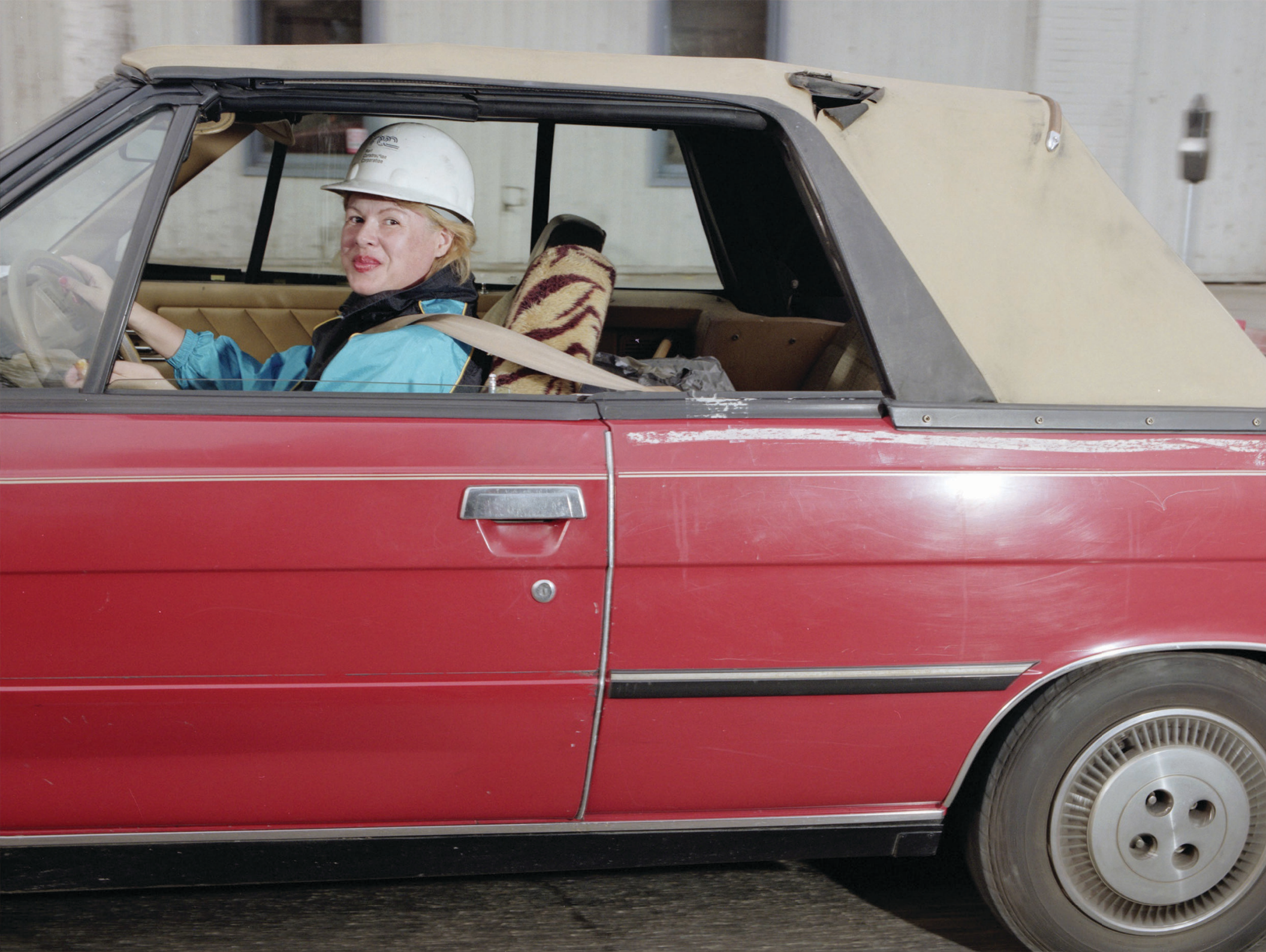
Woman headed west on Melrose Avenue at 33 mph on a Monday at 4:44 PM in January, 1995, 1995