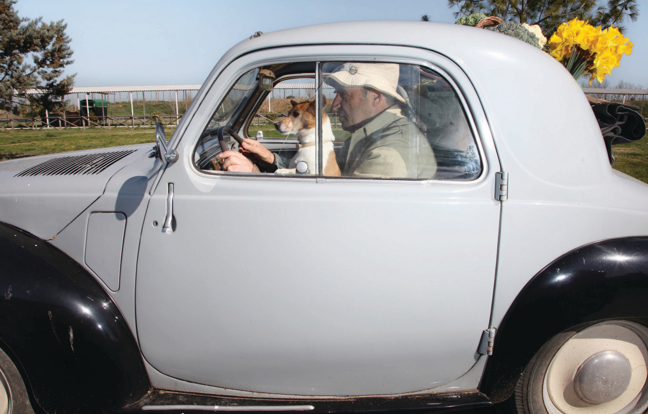
Andrew Bush | Man headed southwest at 0 mph on a dirt road near a farmer's market outside of Rome, Italy, at 9:38 AM on March 15th, 2012