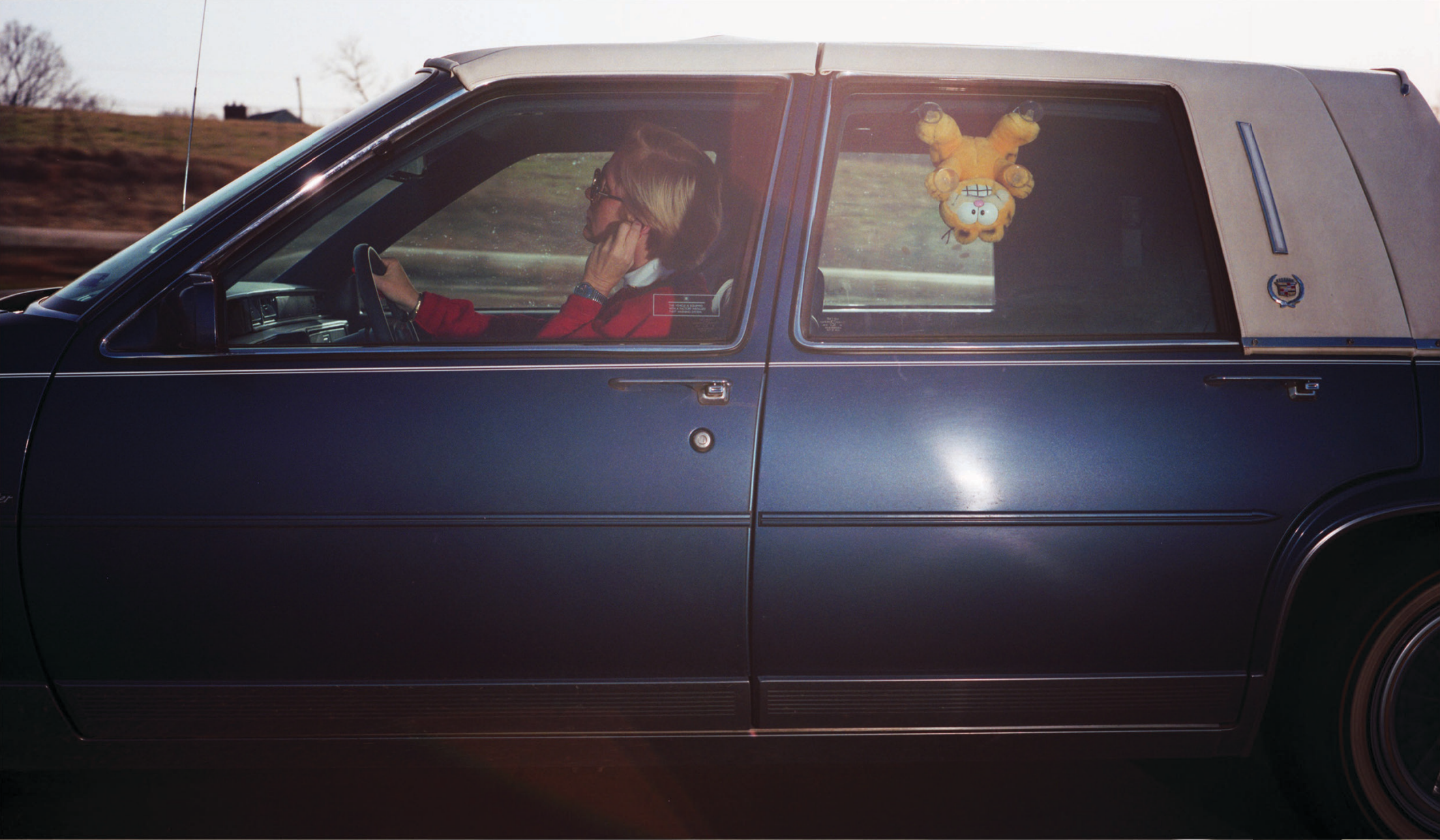
Andrew Bush | Woman headed southwest at 71 mph on an Interstate Highway in the Midwestern United States on a Tuesday in 1994, 1994