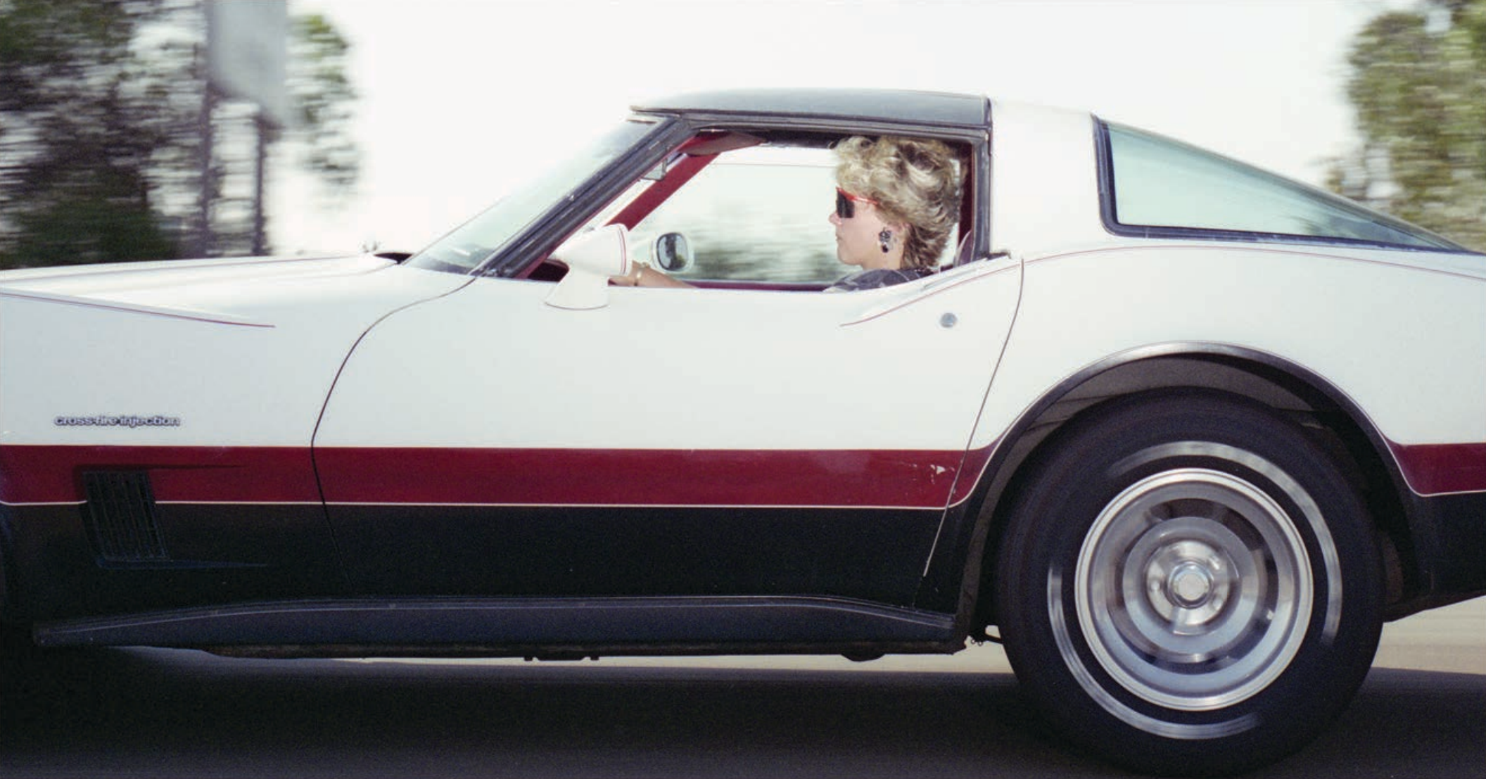
Andrew Bush | Woman heading southbound on the 101 freeway at approximately 77 mph on weekday in June of 1994, 1994