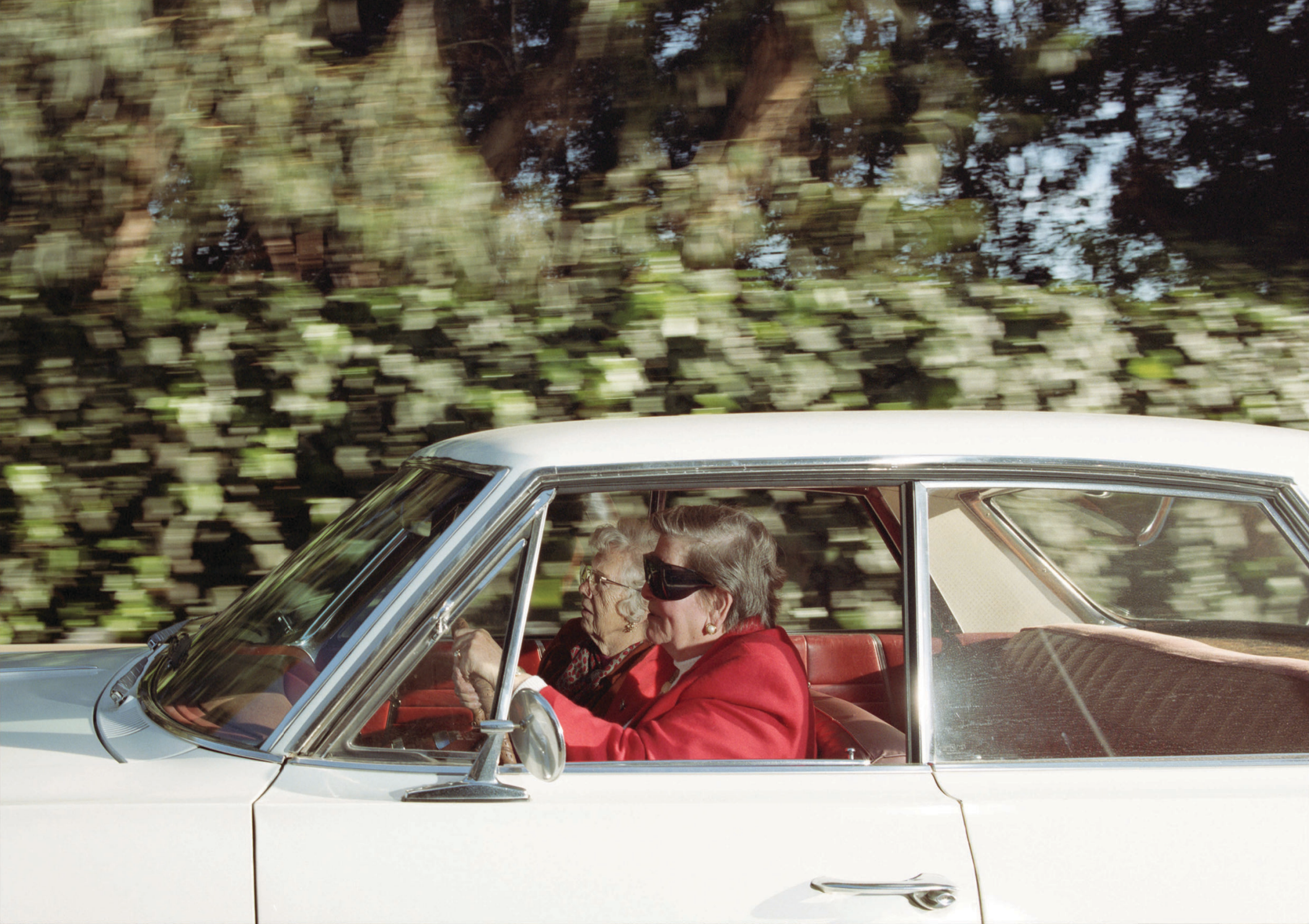
Women racing southwest at 41 mph along 26th Street near the Riviera Country Club, Pacific Palisades, California, at 1:14 p.m. on a Tuesday in February 1997, 1997