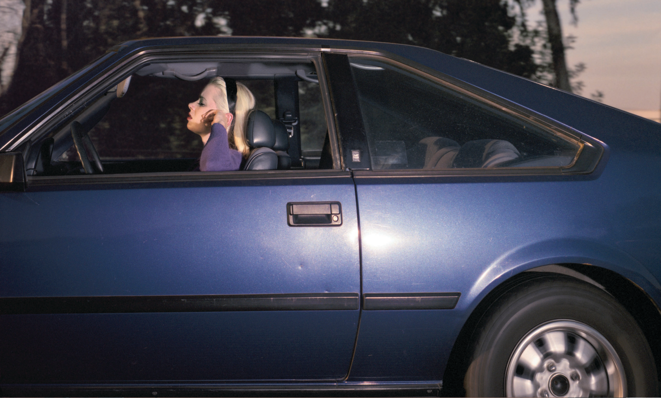
Andrew Bush | Woman gliding southeast at 64 mph on U.S. Route 101 near Santa Barbara at 4:39 p.m. sometime in March 1990, 1990