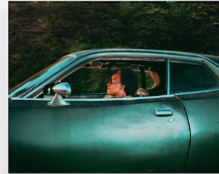
Andrew Bush | Installation view with 30 x 40 inch Vector Portraits