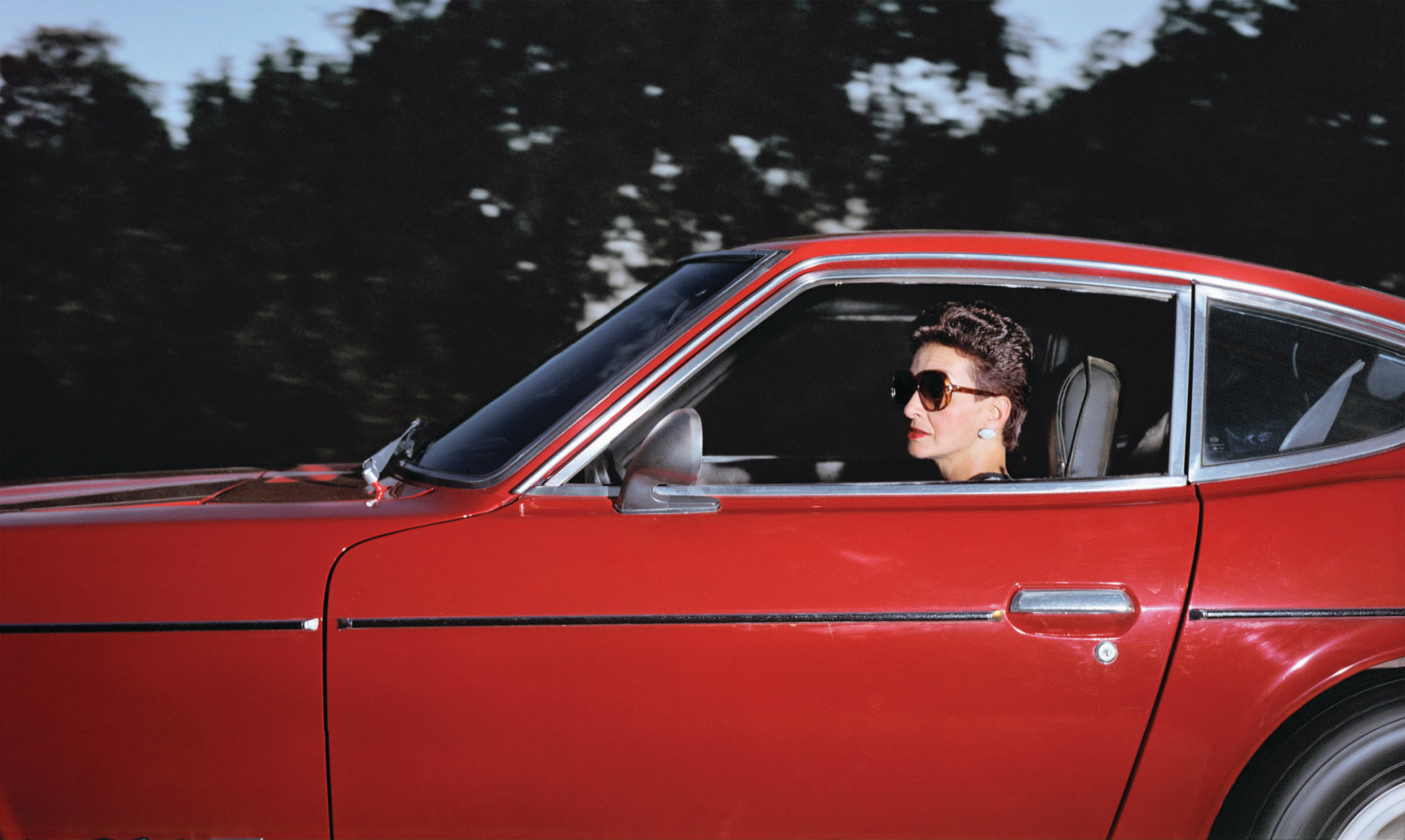
Andrew Bush | Woman wheeling down Sunset Boulevard at 34 mph in Beverly Hills on an afternoon in the summer of 1990, 1990