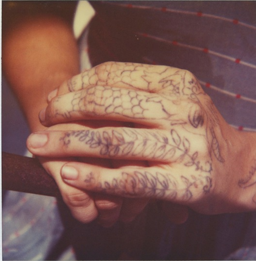
Mike Brodie | Ali's hand , 2005 Polaroid photograph, unique | 3 1/2 x 4 1/4 inches (8.9 x 10.8 cm)