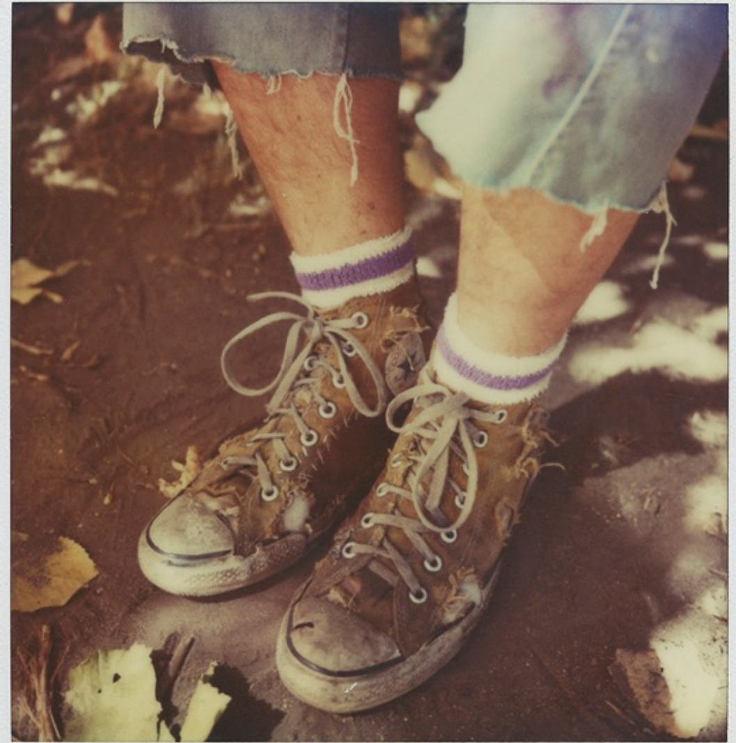
Mike Brodie | All-Stars , 2005 Polaroid photograph, unique | 3 1/2 x 4 1/4 inches (8.9 x 10.8 cm)