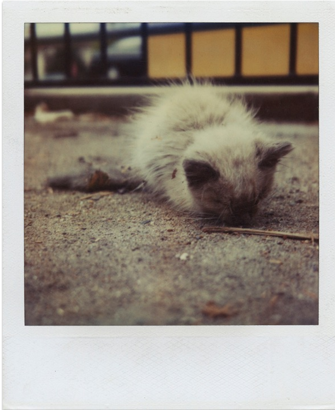
Mike Brodie | Dying alley cat, Denver, Colorado, 2005 Polaroid photograph, unique | 3 1/2 x 4 1/4 inches (8.9 x 10.8 cm)