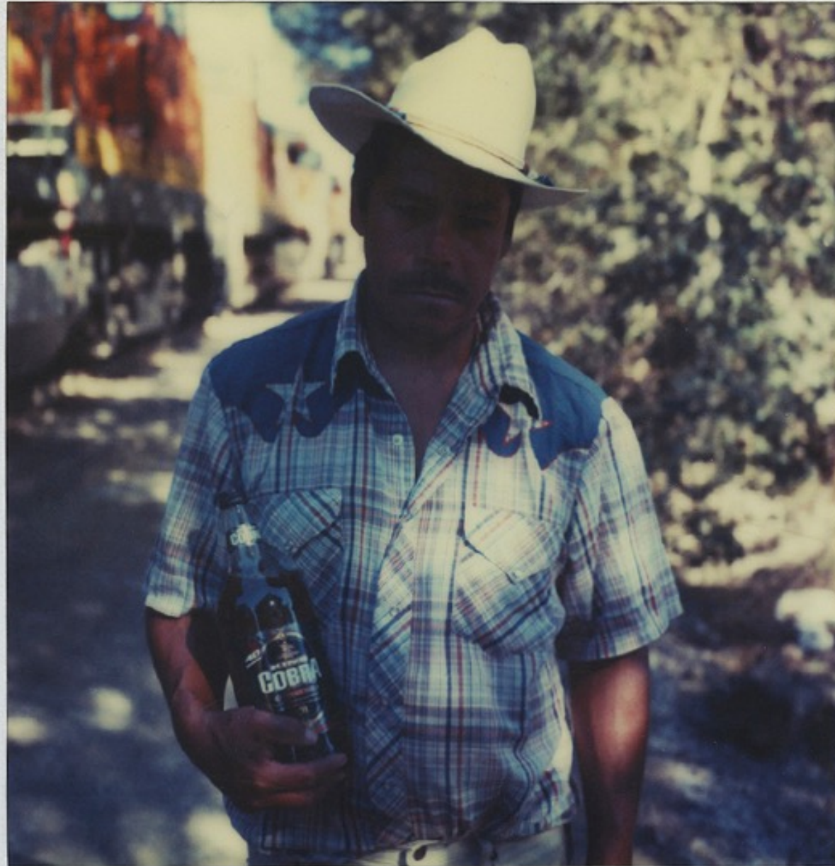
Mike Brodie | King Cobra, Ash Fork, Arizona, 2005 Polaroid photograph, unique | 3 1/2 x 4 1/4 inches (8.9 x 10.8 cm)