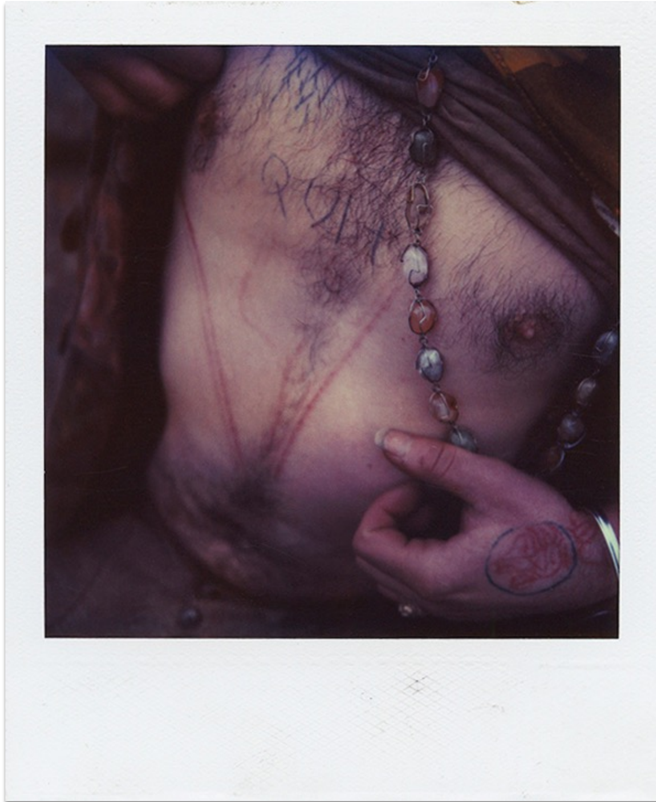
Mike Brodie | QUIT , 2005 Polaroid photograph, unique | 3 1/2 x 4 1/4 inches (8.9 x 10.8 cm)