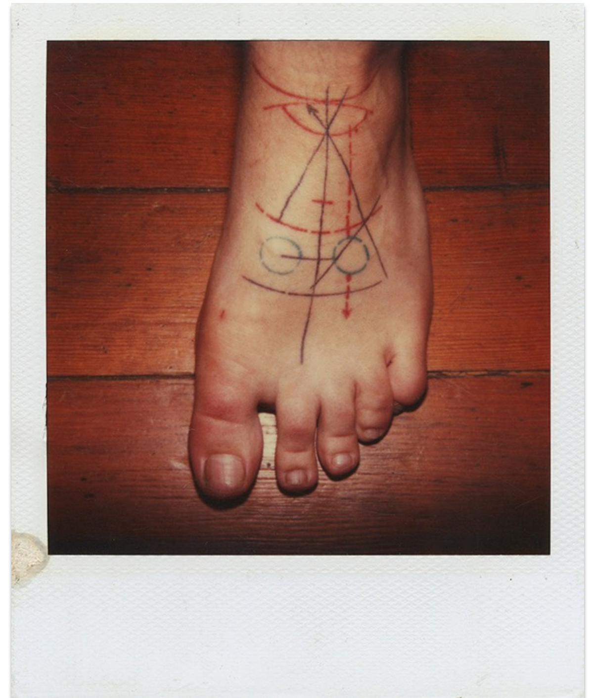
Mike Brodie | Instructions for operating a forklift 2/2 , 2005 Polaroid photograph, unique | 3 1/2 x 4 1/4 inches (8.9 x 10.8 cm)