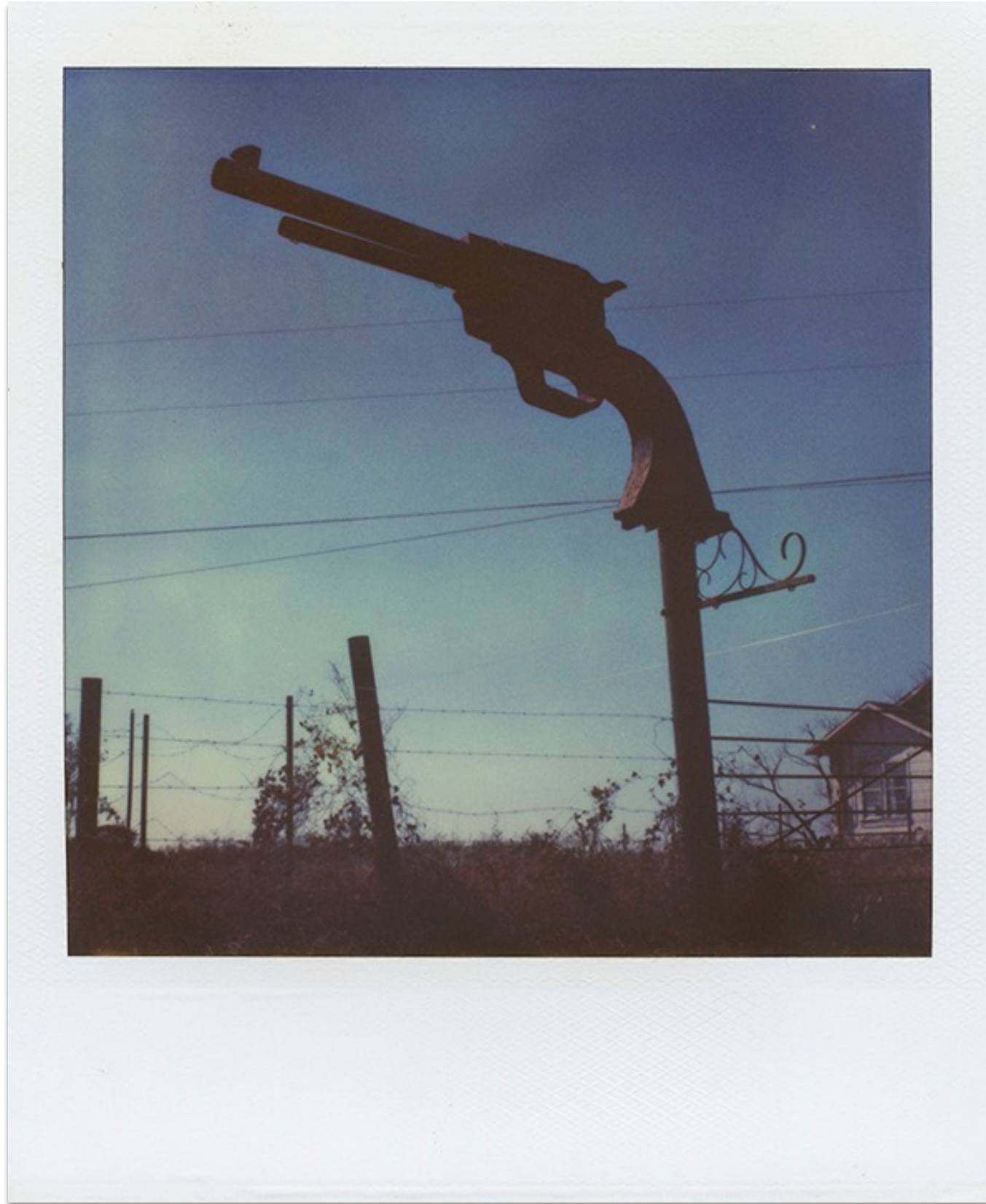
Mike Brodie | Pistol, Somewhere in Texas , 2012 Polaroid photograph, unique | 3 1/2 x 4 1/4 inches (8.9 x 10.8 cm)