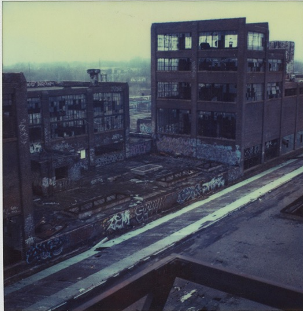
Mike Brodie | Gypsum factory, West Philadelphia, Pennsylvania, 2005 Polaroid photograph, unique | 3 1/2 x 4 1/4 inches (8.9 x 10.8 cm)