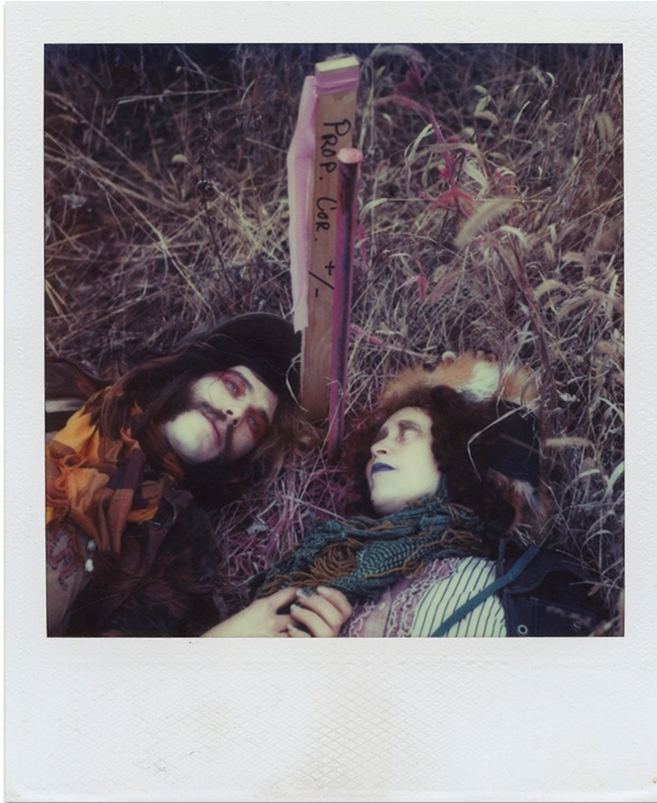
Mike Brodie | Untitled #1 , 2005 Polaroid photograph, unique | 3 1/2 x 4 1/4 inches (8.9 x 10.8 cm)