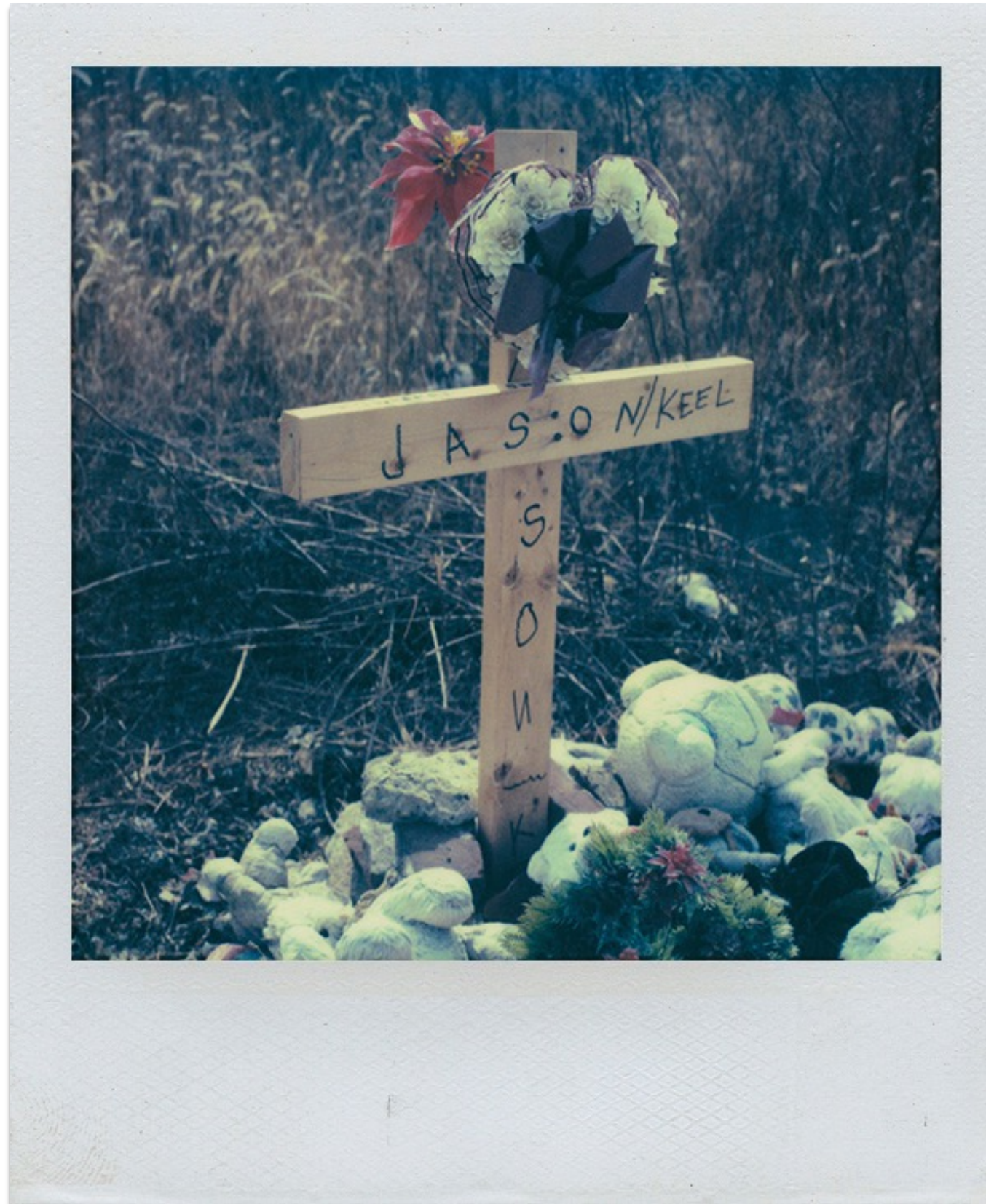
Mike Brodie | Four-wheeler accident , 2005 Polaroid photograph, unique | 3 1/2 x 4 1/4 inches (8.9 x 10.8 cm)