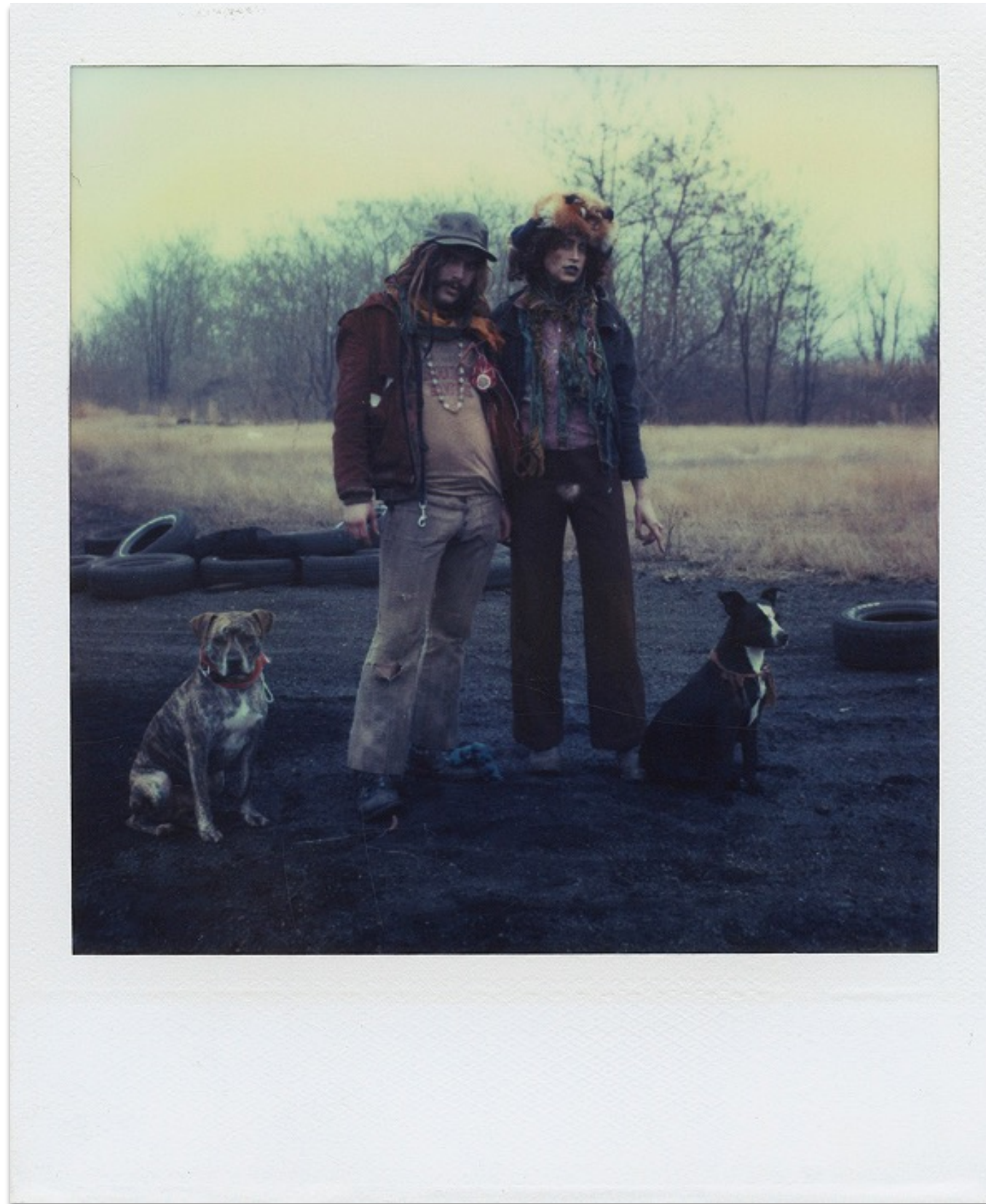
Mike Brodie | Untitled #2 , 2005 Polaroid photograph, unique | 3 1/2 x 4 1/4 inches (8.9 x 10.8 cm)