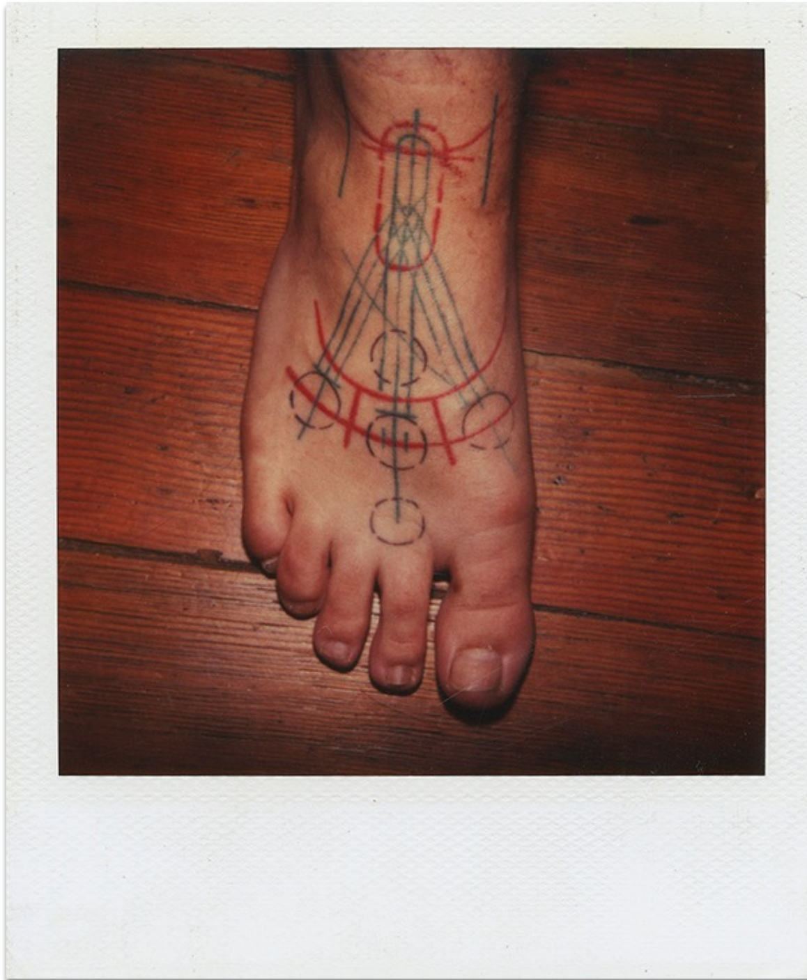
Mike Brodie | Instructions for operating a forklift 2/2 , 2005 Polaroid photograph, unique | 3 1/2 x 4 1/4 inches (8.9 x 10.8 cm)