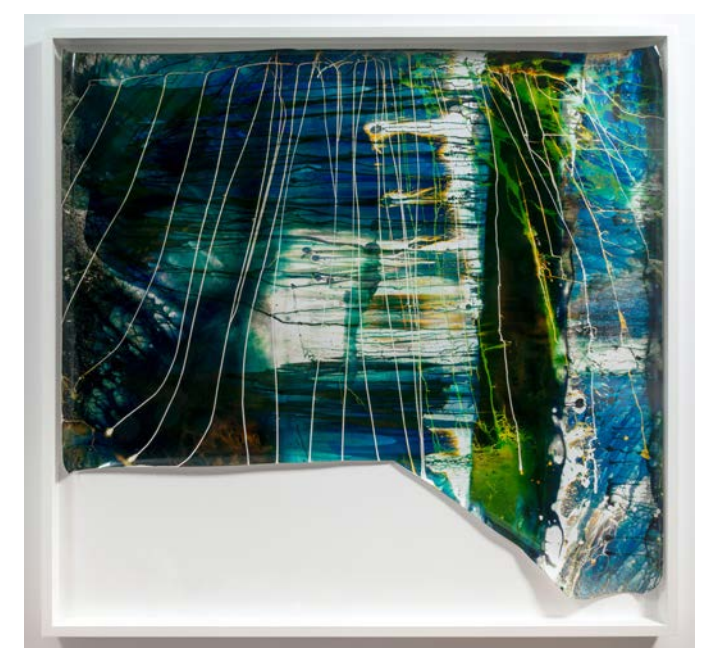
Mariah Robertson 42 2013 Unique chemical treatment on RA-4 paper 72 x 72 inches